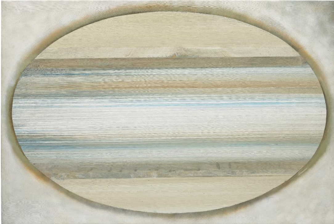
Ed Clark Gray Force 83 x 111 in. (210.8 x 281.9 cm) Painted in 1972 Estimate: $400,000 - 600,000