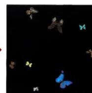
Damien Hirst Kill Monster, 2008 Estimate: $100,000 - 150,000