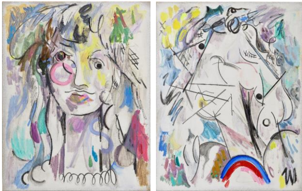
Laura Owens Untitled (LO 441) , 2011 Estimate: $150,000 - 200,000

This is further emphasized by the incredibly immersive nine-foot canvas, which allows the viewer to see the energy behind Clark's wide sweeping motions. Gray Force comes to auction simultaneously with Clark's solo exhibition at Hauser & Wirth in New York. The work comes from the same esteemed collection as two important works on paper by Norman Lewis – Untitled and Blue Cloud – which, together, speak to the necessity of viewing Black artists' work as integral to the narrative of art history.