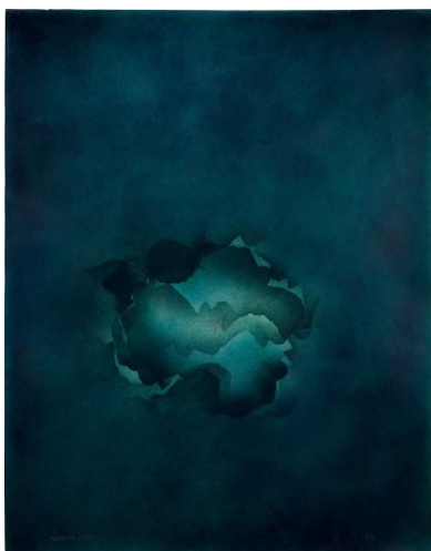
Norman Lewis Blue Cloud, 1964 Estimate: $20,000-30,000