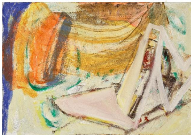
Pam Evelyn Anchor, 2021 Estimate: $10,000 - 15,000