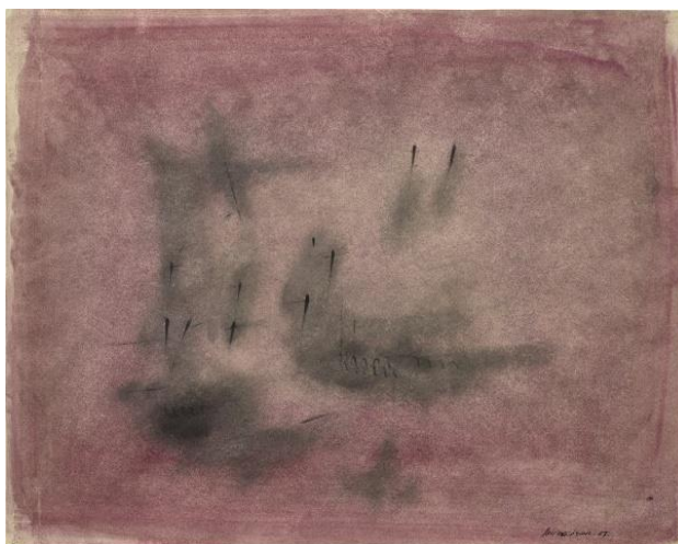
Norman Lewis Untitled, 1952 Estimate: $20,000-30,000