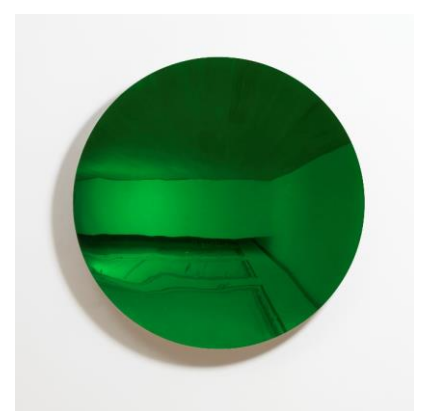
Anish Kapoor Untitled , 2011 Estimate: $300,000 - 400,000

Another top lot in the sale is Laura Owens' Untitled (LO 441) , 2011, which is a celebration of her iconic and idiosyncratic painterly style. Owens engages with the fine arts and the everyday in equal measure and, in the case of this work, evokes Picasso with the features of the woman's face reminiscent of that artist's finest portraits of Marie-Thérèse Walter. Owens' working method, which combines traditional draftsmanship and digital tools like Photoshop, introduces an element of translation, weaving techniques of older artistic styles into the 21st century. Untitled