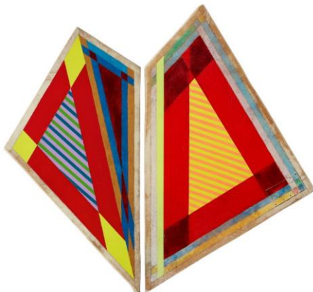
Jeffrey Gibson Turn it up, 2012 Estimate: $18,000 - 25,000