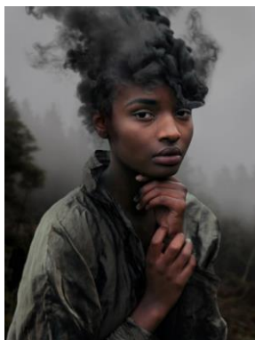
David Uzochukwu Wildfire from In the Wake , 2015 Estimate: £10,000 - 15,000