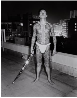
Seiji Kurata Tattooed Man , 1975 Estimate: £20,000 - 30,000

Another highlight of the sale is Japanese photographer Seiji Kurata's masterwork Tattooed Man . In the summer of 1975, Kurata embarked on a bold exploration of Tokyo's underworld, capturing its essence with his medium-format camera. This photograph, taken on a building rooftop in Ikebukuro, portrays a heavily inked yakuza with a samurai sword. The cover of his acclaimed monograph Flash Up: Street PhotoRandom Tokyo 1975-1979 , this image delves into the hidden layers of 1970s Tokyo to reveal the pride and determination of his subject. Kurata's work, including Tattooed Man , has found a place in prestigious institutions such as the Brooklyn Museum and the Tokyo Photographic Art Museum, underscoring its enduring significance.