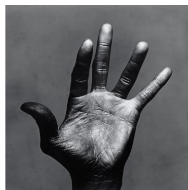
Irving Penn The Palm of Miles Davis , New York, 1986 Estimate: £40,000 - 60,000