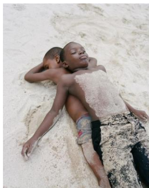
Renell Medrano Untitled from PAMPARA , 2019 Estimate: £10,000 - 15,000