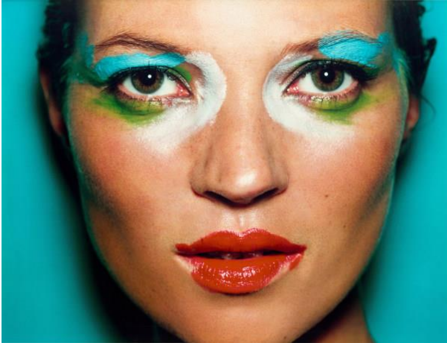
Mario Testino Kate Moss, London, 2001 Estimate: £60,000 - 80,000

Sale on 16 May to Include Four Auction Debuts in ULTIMATE