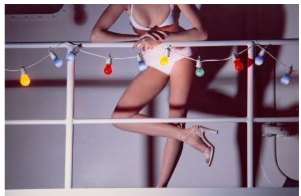
Guy Bourdin Charles Jourdan , Spring 1978 Estimate: £15,000 - 25,000