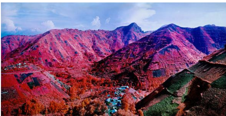
Richard Mosse I Walk the Line , 2012 Estimate: £18,000 - 22,000

A contemporary highlight of the sale is I Walk the Line by Richard Mosse. Using Kodak Aerochrome, a colour infrared film originally developed for military reconnaissance, Mosse photographed the Congo. This choice of film rendered the lush jungle greens and military uniforms of the rebels in lavenders, crimsons, and hot pink, confronting us with an ethereal, otherworldly landscape. A further notable highlight on offer is an oversized edition 1/1 work by Guy Bourdin, whose highly stylised images are instantly recognisable.