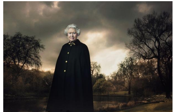
Annie Leibovitz Queen Elizabeth II, Buckingham Palace, London, 2007 Estimate: £25,000 - 35,000

Also featured in the sale are two portraits of Queen Elizabeth II, both of which were captured in 2007 by renowned photographer Annie Leibovitz, the first American to be invited to take an official portrait of the Queen. Drawing inspiration from classical royal portraiture, Leibovitz skillfully uses post-production techniques to infuse her images with a timeless historical resonance. Both portraits of the Queen featured in this sale were included in the artist's Master Set , a curated collection of her most important images.