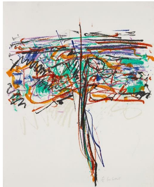
Joan Mitchell, Tree I , 1993 SOLD for $40,640