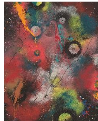
Futura THEY SAW US , 2019 Estimate: HK$ 200,000-400,000