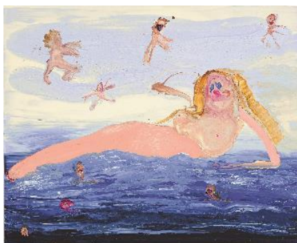
Genieve Figgis Birth of Venus (After Alexandre Cabanel) , 2018 Estimate: HK$ 250,000-400,000