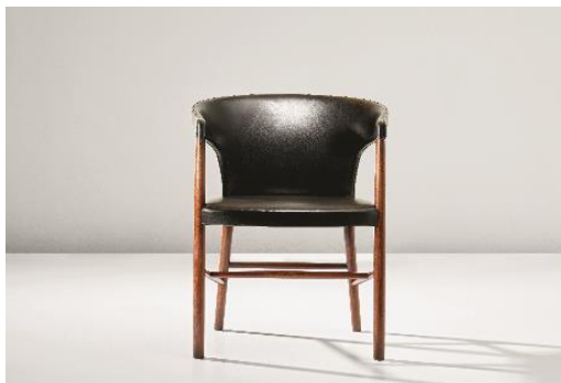
Jacob Kjaer ‘U.N.’ armchair, model no. B48 Estimate: HK$ 20,000-30,000