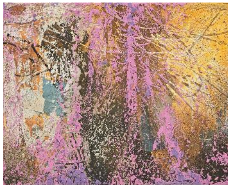
José Parlá Friends Around Town , 2019 Estimate: HK$ 420,000-520,000