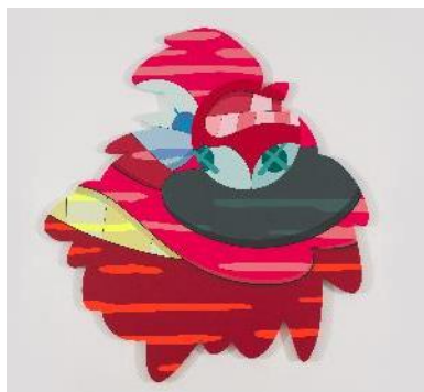
KAWS TALK BACK , 2013 Estimate: HK$ 8,000,000 - 12,000,000

Rendered in deep shades of purple and red in vertical and horizontal striations, Abstraktes Bild (715-6) is a particularly beautiful example of German visual artist Gerhard Richter’s best-known series of Abstrakte Bilder , and has been included in major institutional retrospectives of Richter’s oeuvre. Streaked with undulating monochrome streaks and fiery elements of golden-yellow periodically exposed through the disfigured paint layers, the artist revisited a favourite personal challenge of unifying bright colors with his more usually muted, melancholy colour palette. Gerhard Richter is widely considered “the greatest modern painter” and one of the most influential living artists today. Known particularly for his powerful abstract works, the enigmatic Richter has been compared by art historians and critics to artists as diverse as Johannes Vermeer and Pablo Picasso.