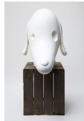
Yoshitomo Nara The Prototype of the Head of Morioka Pup , 2005 Estimate: HK $ 1,500,000-2,000,000