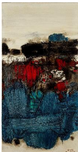
Chu Teh-Chun No.164, 1963 Estimate: HK$ 6,000,000- 8,000,000