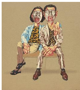
Zeng Fanzhi Mask Series No. 1, 1996 Estimate: HK$ 14,000,000- 24,000,000