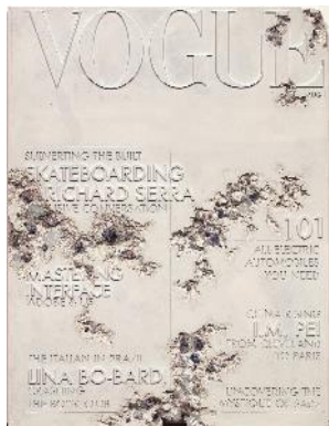
Daniel Arsham Quartz Eroded Vogue Magazine 101 , 2019 Estimate: HK$ 150,000-250,000

As part of the 20th Century & Contemporary Art & Design Hong Kong Day Sale, Phillips is delighted to present a unique charity component to the sale in partnership with the non-profit organisation Hong Kong Contemporary Art (HOCA) Foundation, which is based on the phenomenon of street art as a movement that represents a significant cultural turning point in the last few years. This section of the sale will feature 10 works generously donated by 8 established international artists, including Futura , José Parlá , Daniel Arsham and Cleon Peterson . The proceeds of these works will be redirected to HOCA's future initiatives, helping the Foundation to democratise art and enrich the cultural life of Hong Kong.