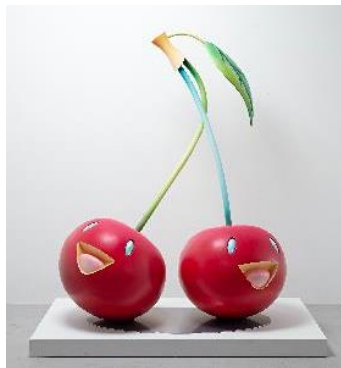
Takashi Murakami Cherries , 2005 Estimate: HK$ 3,000,000-5,000,000