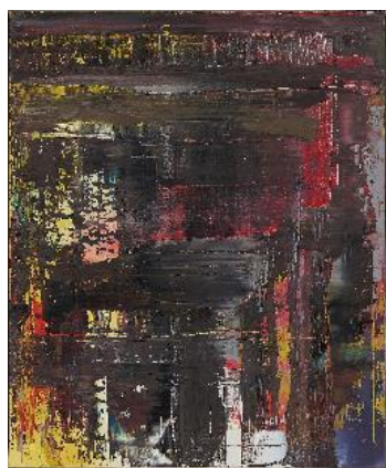
Gerhard Richter Abstraktes Bild (715-6) , 1990 Estimate: HK$ 20,000,000-25,000,000

Rendered in deep shades of purple and red in vertical and horizontal striations, Abstraktes Bild (715-6) is a particularly beautiful example of German visual artist Gerhard Richter’s best-known series of Abstrakte Bilder , and has been included in major institutional retrospectives of Richter’s oeuvre. Streaked with undulating monochrome streaks and fiery elements of golden-yellow periodically exposed through the disfigured paint layers, the artist revisited a favourite personal challenge of unifying bright colors with his more usually muted, melancholy colour palette. Gerhard Richter is widely considered “the greatest modern painter” and one of the most influential living artists today. Known particularly for his powerful abstract works, the enigmatic Richter has been compared by art historians and critics to artists as diverse as Johannes Vermeer and Pablo Picasso.