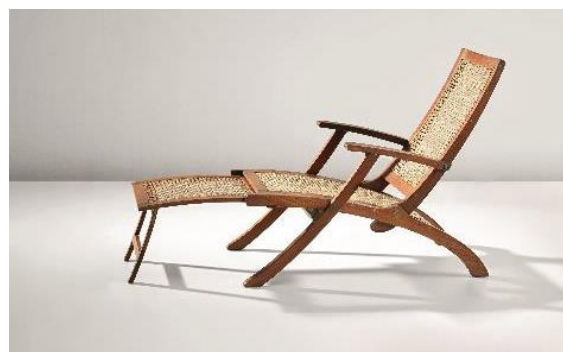
Kaare Klint Extendable deckchair, model no. 4699 Estimate: HK$ 10,000-20,000