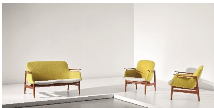
Finn Juhl Left: Sofa, model no. FJ 53 ; Bangkok teak, fabric, brass Estimate HK$ 120,000-220,000 Right: Pair of easy chairs, model no. FJ 53 ; Bangkok teak, fabric, brass Estimate HK$ 150,000-250,000