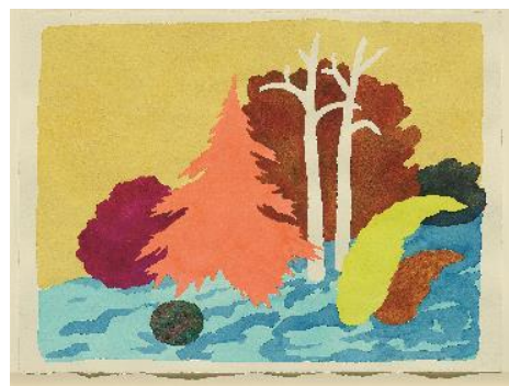
Nicolas Party Landscape , 2013 Estimate: HK$ 320,000-450,000