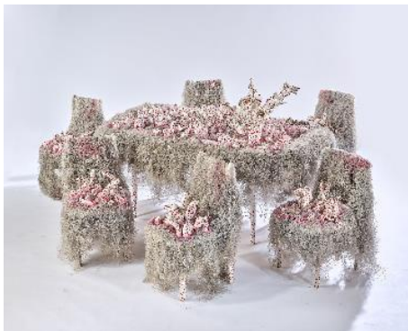
Yayoi Kusama Six Guests , 1986 Estimate: HK$7,000,000 - 9,000,000

Created in 2005, Takashi Murakami's Cherries was executed the same year as the artist's flourishing collaboration with Marc Jacobs for Louis Vuitton. The long-snouted white puppy with floppy ears is amongst Yoshitomo Nara's most beloved characters. Its outwardly innocent form encapsulates a deeply held set of emotions spanning childhood memories, spirituality, and loneliness. Representative of the prolific Japanese artist's style, Nara's prototype relates to audiences of all ages while possessing strong spiritual and autobiographical qualities.