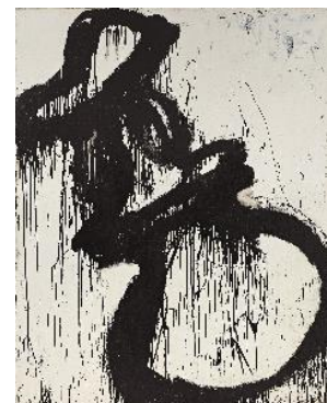
Joyce Pensato Donald , 1997 Estimate: HK$ 450,000-550,000