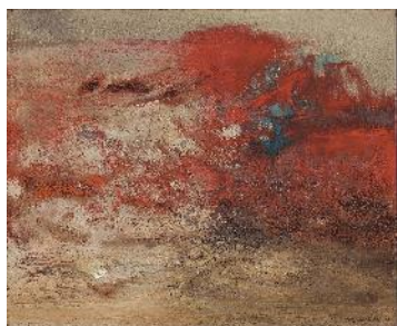
Zao Wou-Ki 29.05-31.10.68, 1968 Estimate: HK$ 28,000,000- 38,000,000