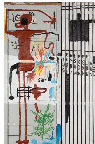
Jean-Michel Basquiat Thermopolae , 1985 Estimate: HK$ 26,000,000-38,000,000

The Evening Sale presents Jean-Michel Basquiat’s Thermopolae , created in the later years of Basquiat’s brief but intense artistic career. Thermopolae is in many ways an anti-painting, a subversive semi-autobiographical masterpiece that draws on Western historical narratives and Classical mythological roots, but upturns accepted moral, spiritual, political meanings to speak passionately about life, death, love, virtue, and justice in postwar America, particularly amongst the Afro-American community and other marginalised bodies. Thermopolae is a reference to the Battle of Thermopylae in 480 BC, fought between the doomed Greeks and invading Persians at the narrow coastal pass of Thermopylae (in Latin, “the hot gates”). In the hands of Basquiat’s wordplay, the title of the battle becomes bastardised - “a little heat”, rather than the most famous military last stand of Western civilisation.