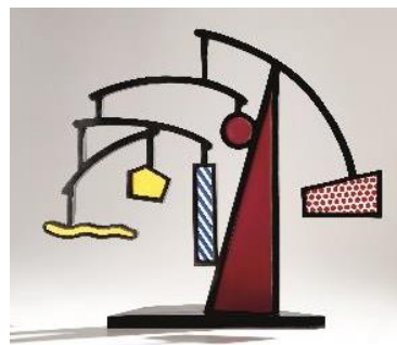
Roy Lichtenstein Mobile I , 1989 Estimate: HK$ 4,000,000 - 6,000,000 (From the Miles & Shirley Fiterman Collection)