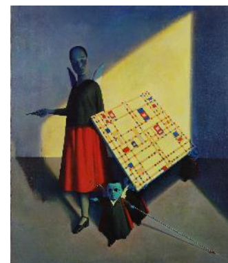
Liu Ye She Isn't Afraid of Mondrian , 1995 Estimate: HK$ 18,000,000- 28,000,000

A strong selection of Chinese Modern and Contemporary works will be offered in the Evening Sale, led by Zao Wou-Ki's 29.05-31.10.68. In the present work, Zao's vigorous brushwork illustrates the battle between the four elements: fire, earth, air and water. To balance this epic encounter, the painting is divided into three horizontal bands which give a sense of stability to the central swirling composition. If the 1950s were associated with the Oracle Bones period and the appearance of signs in Zao's works, in the 1960s his work grew increasingly abstract and vibrant. Another masterwork to be presented in the Evening Sale is Chu Teh-Chun's No.164. In this work, Chu's choice of colours captures his control of balance and depth in an intricate game of texture, alternating ink-like washes of deep blue and green with saturated hues of bright red outlined by solid black lines. The artist successfully diluted oil paints to create the visual effect of thin ink-like washes, whilst containing them to allow negative space. With canvas as a basis and oil as a medium, Chu perfectly translates a milestone of Chinese tradition into the most Western expression.