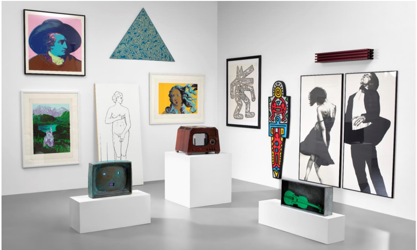
Highlights from the Archive of Edition Schellmann

Further Highlights Include Pieces by Andy Warhol, Rashid Johnson, Ed Ruscha, Mel Bochner, KAWS, Marc Chagall, and Banksy