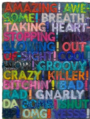
Mel Bochner Amazing , 2018 Estimate: £30,000 - 50,000