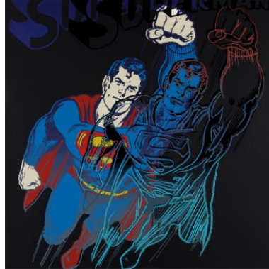
Andy Warhol Superman , from Myths (F. & S. 260), 1981 Estimate: £150,000 - 200,000