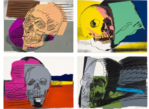
Andy Warhol Skulls (F. & S. II. 157-160), 1976 Estimate: £60,000 - 80,000

Renowned conceptual artist Rashid Johnson, born in Chicago and now based in New York, gained international acclaim for his distinctive portrayal of the African-American experience through abstract art. Anxiety, both as a symptom and a response to what Johnson terms as 'post-blackness', negotiates the tensions between celebrating blackness and rejecting its limitations. It permeates through much of Johnson's works, and is shown here Untitled (Large Anxious Red) . Johnson made a selection of works, including the present lot, titled the Untitled Anxious Red series after the onset of the global coronavirus pandemic.