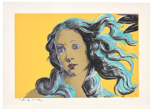
Andy Warhol Details of Renaissance Paintings (Sandro Botticelli, Birth of Venus, 1482) (see F. & S. 316-319), 1984 Estimate: £80,000 - 120,000