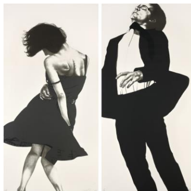
Robert Longo Men in the Cities (Meryl and Jonathan) , 1988 Estimate: £40,000 - 60,000