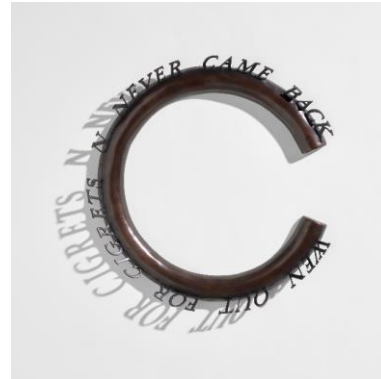
Ed Ruscha Wen Out for Cigaretts N Never Came Back , 2017 Estimate: £60,000 - 80,000