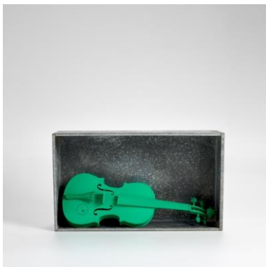
Joseph Beuys Zwei Fluxus-Objekte: Grüne Geige (Two Fluxus Objects: Green Violin) (S. 135), 1974 Estimate: £12,000 - 18,000