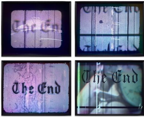
Ed Ruscha The End #1-#4 , 1998-2016 Estimate: £60,000 - 80,000