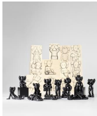
KAWS Bronze Figures , 2022 Estimate: £30,000 - 50,000