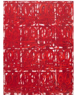
Rashid Johnson Untitled (Large Anxious Red) , 2021 Estimate: £30,000 - 50,000

Renowned conceptual artist Rashid Johnson, born in Chicago and now based in New York, gained international acclaim for his distinctive portrayal of the African-American experience through abstract art. Anxiety, both as a symptom and a response to what Johnson terms as 'post-blackness', negotiates the tensions between celebrating blackness and rejecting its limitations. It permeates through much of Johnson's works, and is shown here Untitled (Large Anxious Red) . Johnson made a selection of works, including the present lot, titled the Untitled Anxious Red series after the onset of the global coronavirus pandemic.