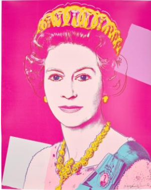
Andy Warhol Queen Elizabeth II of the United Kingdom , from Reigning Queens (Royal Edition) (F & S. 336A), 1985 Estimate: £200,000 - 300,000

In 1985 Andy Warhol started his Reigning Queens series, his largest portfolio of screenprints, featuring Queen Elizabeth II, Queen Beatrix of the Netherlands, Queen Margrethe II of Denmark, and Queen Ntfombi Tfwala of Swaziland. The series paid homage to these female monarchs, emphasising Warhol's fascination with fame and consumer culture by appropriating their widely-circulated images. In a parallel exploration, Warhol's artistic tribute to Superman reflects his childhood connection to the superhero, turning it into a nostalgic time capsule representative of his formative years. This vibrant artwork captures Superman's iconic pose, celebrating the enduring American icon and exploring the intersections between art, personal experience, and cultural symbolism. Other notable works by Warhol, such as his Skulls series and his portrait of Mick Jagger, are also included in the sale, alongside unique Warhol trial proofs from the Archive of Edition Schellmann.