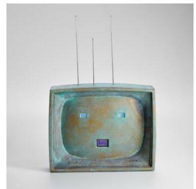
Nam June Paik Born Again , 1991 Estimate: £15,000 - 20,000