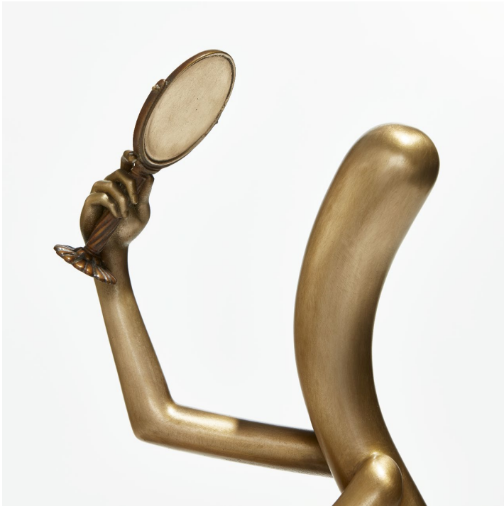
Close up of Gazer

To be Exclusively Released on 10 October at 10am