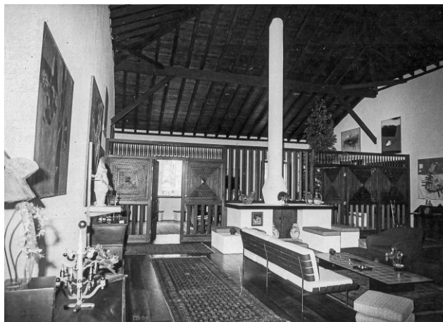
The present unique coffee table in the Profili's house Itapacerica da Serra, Brazil, 1970

Further highlights of this group include Tenreiro's ' Mesa triangular ' dining table, Zanine Caldas' ' Namoradeira ' rocking love seat and Fernando and Humberto Campana's renowned ' Sushi ' sofa.