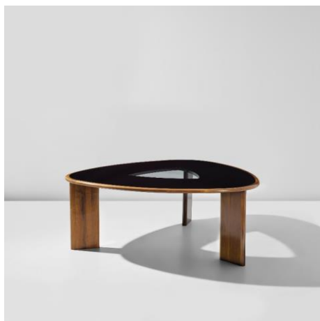
Joaquim Tenreiro 'Mesa triangular' dining table, circa 1960 Estimate: £40,000 - 60,000

Further highlights of this group include Tenreiro's ' Mesa triangular ' dining table, Zanine Caldas' ' Namoradeira ' rocking love seat and Fernando and Humberto Campana's renowned ' Sushi ' sofa.