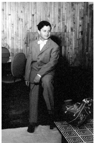
The present unique coffee table in Profili's house, Itapacerica da Serra, Brazil, 1970

philosophy and artistic approach. Featuring hand-painted tiles by artist Regina Bolonha, the table's sleek design showcases Tenreiro's craftsmanship, with its wood structure meticulously crafted to accentuate the composition of the striking tiles. The table's subtle details, from the bevelled feet to the dark frame perfectly matching the painted motif, underscore Tenreiro's technical prowess as a skilled carpenter and highlight his enduring impact as one of Brazil's foremost modern designers.