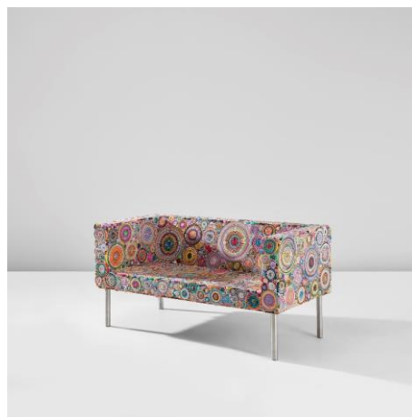
Fernando Campana and Humberto Campana 'Sushi' sofa, designed 2002, produced 2005 Estimate: £20,000 - 30,000