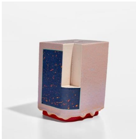
Ron Nagle "Retro-Geo", 1996 Estimate $7,000 - 9,000