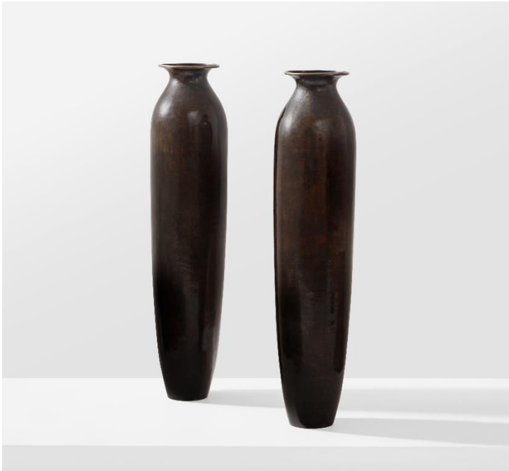
Jean Dunand Pair of monumental vases, circa 1913 Estimate $200,000 - 300,000

Auction on 5 December to Also Feature an Impressive Selection of Ceramics, Italian Design, and Scandinavian Design