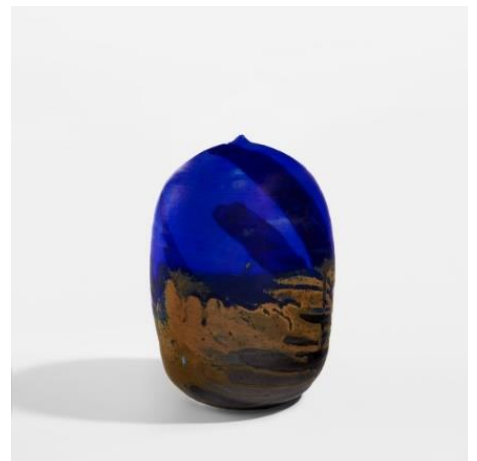
Toshiko Takaezu "Closed Form" , 1995 Estimate $6,000 - 8,000