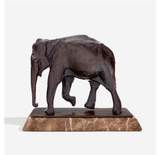
Rembrandt Bugatti "Petit Éléphant en marche" , conceived circa 1912 Estimate $120,000 - 180,000

An admired Italian-born sculptor represented in the sale is Rembrandt Bugatti with one of his most celebrated works, Petit Éléphant en marche , conceived circa 1912. Bugatti spent much of his time at the Jardin des