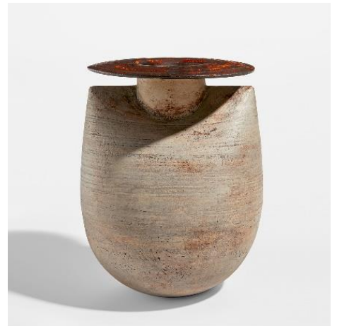
Hans Coper "Sack" form , 1968 Estimate $60,000 - 90,000