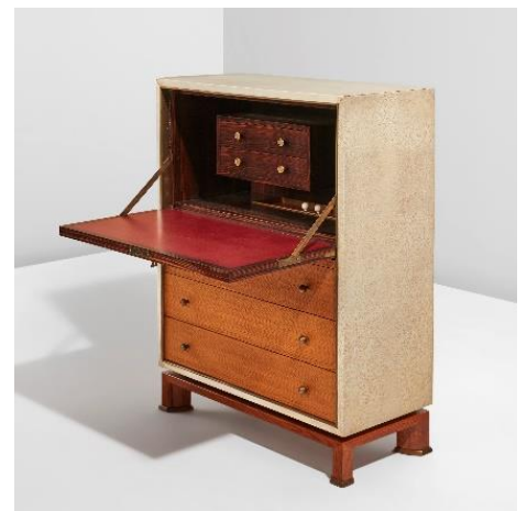
Paul Dupré-Lafon Secrétaire à abattant , 1940s Estimate $60,000 - 80,000