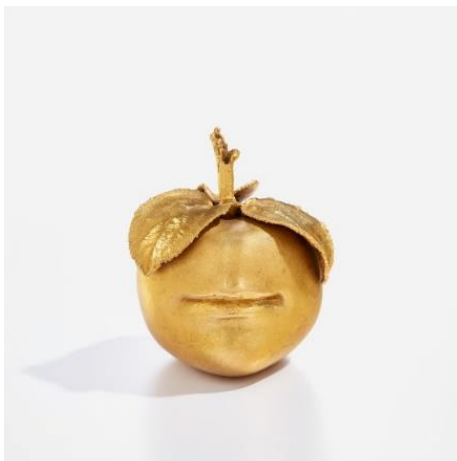
Claude Lalanne "Pomme-Bouche" , circa 1975 Estimate $25,000 - 35,000