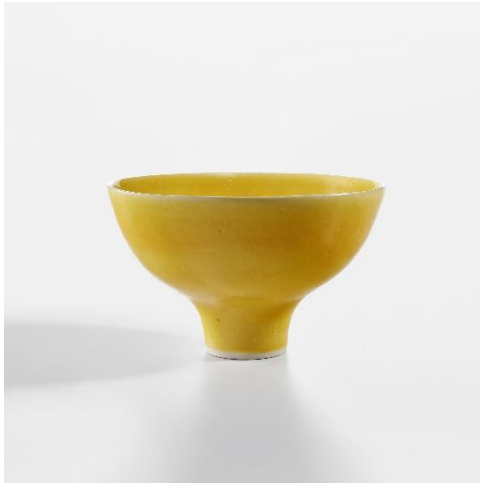
Lucie Rie Footed bowl , circa 1980 Estimate $15,000 - 20,000