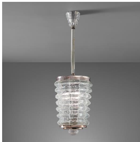
Carlo Scarpa Rare ceiling light , model no. 214A, circa 1931 Estimate $6,000 - 8,000