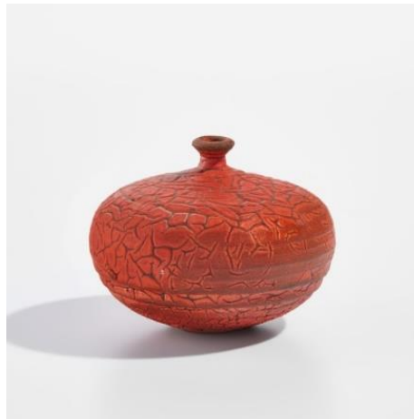
Doyle Lane Weed pot , circa 1970 Estimate $5,000 - 7,000