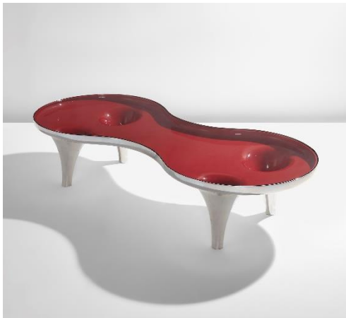
Marc Newson "Orgone Chop Top" coffee table, designed 1990, produced 2004 Estimate $100,000 - 150,000