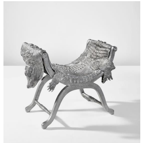
Claude Lalanne "Crococurule", designed 1992, produced 2012 Estimate $80,000 - 120,000

Yves Saint Laurent and the Agnellis to something akin to maximum exposure. The Crococurule in this sale is especially unusual in Claude's oeuvre in that it incorporates a classical chair form, rather than imitation of branches or vines, as seen in her other furniture pieces. Roman in origin, the curule was a seat of honor reserved for magistrates and emperors. By replacing the typical fur with a cast of a crocodile skin, Claude rendered an honorific chair into pure sculpture, in the grandest Surrealist tradition. The naturalistic texture of the animal form cast in metal is a surprising juxtaposition between the cold material and the organic source of inspiration. This playful and unusual merger is signature to the Lalanne's work making even the most variable work sought after by collectors internationally.