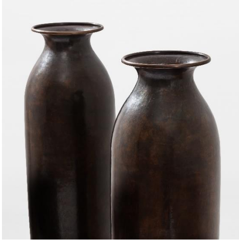
Jean Dunand Pair of monumental vases , circa 1913 Estimate $200,000 - 300,000

Representing the most important designers working in France in the 20th century, makers such as Jean Dunand , Rembrandt Bugatti , and Paul Dupré-Lafon , among others, are featured through out the Design sale.