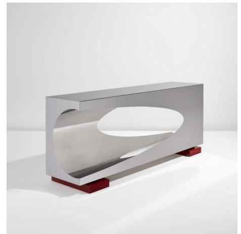
Hervé van der Straeten "Console Piercing N° 358", circa 2006 Estimate $20,000 - 30,000