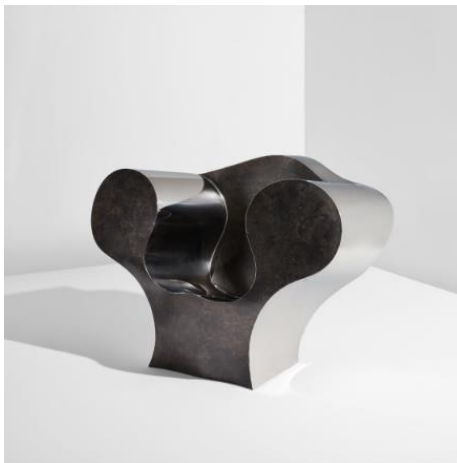
Ron Arad "Big Easy Volume 2" armchair, designed 1988, produced 2004 Estimate $20,000 - 30,000