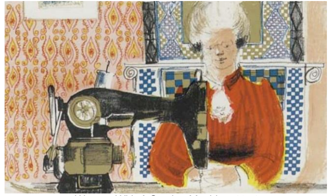
Woman With A Sewing Machine, 1954 Estimate: £10,000 – 15,000