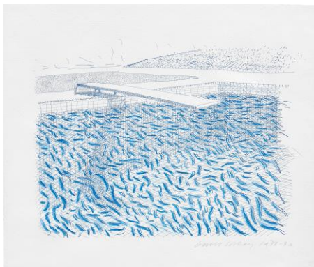
Lithographic Water Made of Lines and Crayon, 1978-80 Estimate: £70,000 – 90,000

Now aged 85, David Hockney continues to combine technical innovation with an endless fascination for exploring how we see and make art, qualities which are hugely appealing to art enthusiasts. As the artist’s work develops so does our interest in it and we are only seeing growth in collectors looking to acquire Hockney’s work. Art collectors of all genres and generations have demonstrated a desire to engage with the artist’s ever-evolving concepts. This accrescent fascination with Hockney’s work is made evident through activations taking place worldwide to celebrate the artist, such as the recent show at Pace Gallery in New York and Palm Beach, the new immersive exhibition open at Lightroom in London, and the upcoming retrospective focused on the artist’s portraiture at London’s National Portrait Gallery, which is scheduled to open in November 2023.