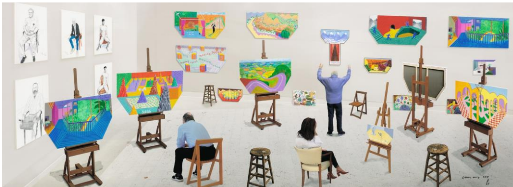
Inside It Opens Up As Well, 2018 Estimate: £50,000 – 70,000