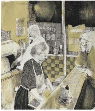
Fish and Chip Shop, 1954 Estimate: £15,000 – 20,000