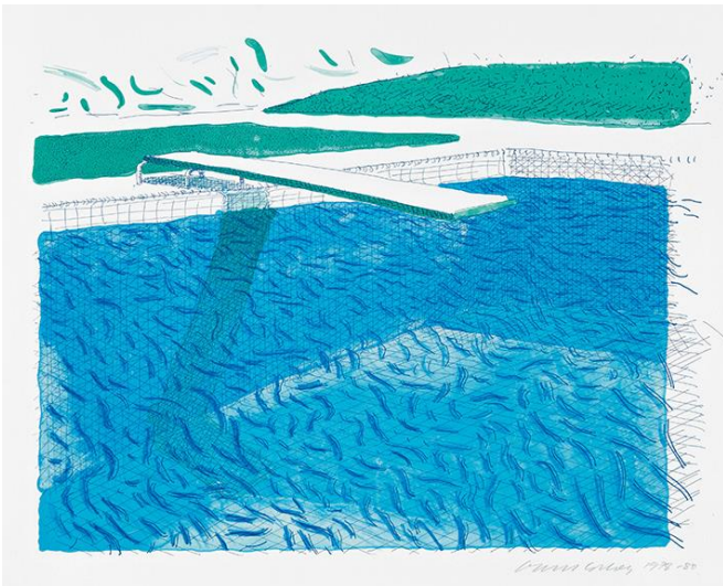
Lithographic Water Made of Lines, Crayon, and Two Blue Washes, 1978-80 Estimate: £80,000 – 120,000

The Next Dedicated Hockney Auction to be Held on 20 September 2023