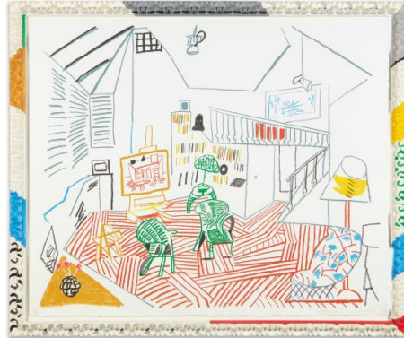
Pembroke Studio Interior, from Moving Focus, 1984 Estimate: £40,000 – 60,000