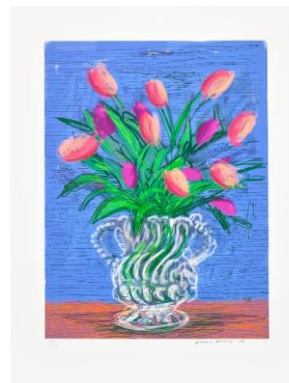
A Bigger Book, Art Edition B, 2010/2016 Estimate: £15,000 – 20,000