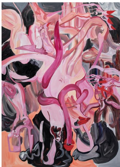
Wynnie Mynerva Bailo mi ritmo, pero no me detengo, 2022

Wynnie Mynerva's Bailo mi ritmo, pero no me detengo approaches black in conversation with other colors, saying, "The black color in my work represents a force of change, of rupture, the mourning of a process of inner healing and respect for transit. The vivacity of sexuality in the most luminous colors but the tragedy in the darkness that represents the changes, the death, and the life of desires. In my work, a body around others, dances and turns with a tongue that extends and coils, a tongue that is configured as his genital organ. The viewer will find other elements such as high-heeled shoes in the shape of knives, long nails that enter an anus, bodies turning around..."