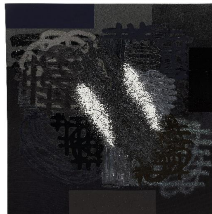
Patrick Alston The Evidence of Things Unseen and Fabric of Existence, 2022