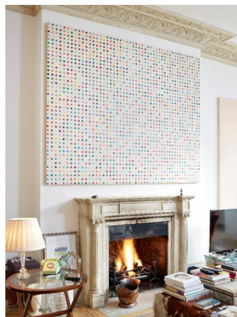
Damien Hirst Antipyrylazo III , 1994 Estimate: £900,000-1,200,000

The collection includes two monumental paintings by Michael Craig-Martin, the mastermind behind this new generation of artists and Hirst's former teacher at Goldsmith's College, London. Full , 2000, is likely to set a world record price for Craig-Martin when it is auctioned in the 20th Century & Contemporary Art Evening Sale on 13 February 2020. By theme of appropriation, each object references seminal art-historical icons: Jasper Johns' paintbrushes, Marcel Duchamp's bottle rack, Man Ray's metronome, and Craig-Martin's very own symbols, including a glass of water and a ladder.