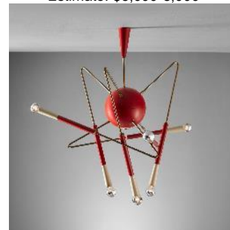
Stilnovo Ceiling light, 1950s Estimate: $5,000-7,000