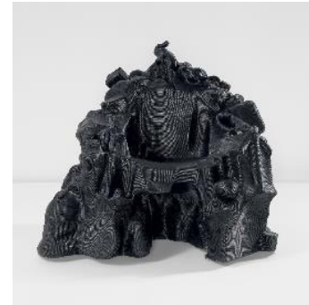
Jay Sae Jung Oh Unique "Savage Chair_ Black Edition_2014", 2014 Estimate: $6,000-8,000