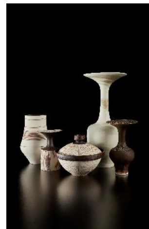
Lucie Rie Ceramics Installation