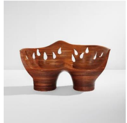
Wendell Castle Settee, 2006 Estimate: $60,000-80,000

The sale also features an important grouping of works by contemporary designer Wendell Castle, known for his functional yet flawlessly crafted design. Among his innovative forms are the pair of chairs from 1967, whose undulating and ergonomic curvilinear forms challenge the traditional vernacular of a chair.