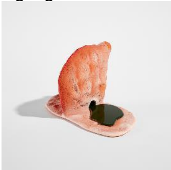
Ron Nagle "Designated Diver", 2011 Estimate: $8,000-12,000