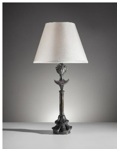
Alberto Giacometti "Tête de femme" table lamp, designed circa 1934, later cast Estimate: $120,000-180,000

Also highlighting the sale is the iconic " Cinderella " Table by Jeroen Verhoven, one of the most innovative and sought after designers of the 21st century. Verhoven became a nearly overnight success with the debut of the " Cinderella " table produced from 2004 – 2007. The deconstructed CNC-cut birch plywood table form is complex—from different vantage points, the table takes on entirely unique shapes. Just as the Cinderella fairytale is a story of transformation, the table transforms based on the viewer's perspective. To construct the table, Verhoeven began by drawing the silhouettes of a baroque table and a bombé chest, iconic furniture forms from the 17 th and 18 th centuries respectively. He then used computer software to merge the silhouettes into one three-dimensional form. By combining these two forms, Verhoeven simultaneously injected himself into a centuries-long history of exquisite artistry and craftsmanship while also heralding a new vision for the future of design. The " Cinderella " table belongs to the permanent collection of museums such as the Museum of Modern Art, New York, the Victoria and Albert Museum, London, and the Centre Pompidou, Paris.