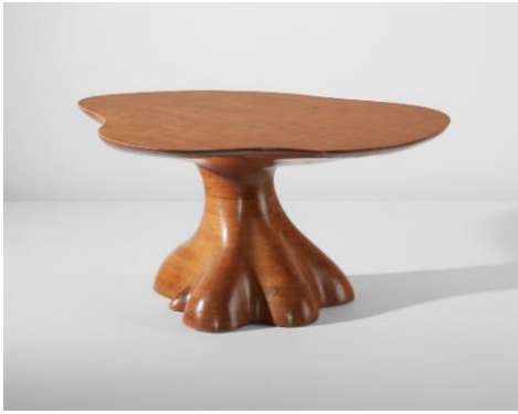
Wendell Castle Dining Table, 1974 Estimate: $80,000 - 120,000