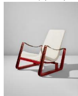
Jean Prouvé "Cit " armchair, circa 1932 Estimate: $100,000-150,000