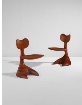
Wendell Castle Pair of Chairs, 1967 Estimate: $80,000 - 120,000