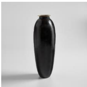
Jean Dunand Important vase, circa 1913 Estimate: $60,000-80,000