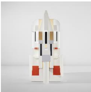
Bruno Gregory Unique "Integrated System (Construction 2)" vanity, 1987 Estimate: $6,000-80,000