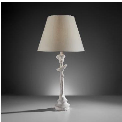
Alberto Giacometti "Écossais" table lamp, circa 1935 Estimate: $100,000-150,000

the play of shadow and light across the pristine white surface.” Tête de Femme , designed circa 1934, is fabricated from cast bronze and has a beautiful rich patina.