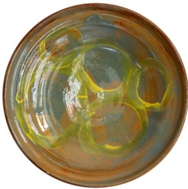
Günther Förg Untitled, 1996