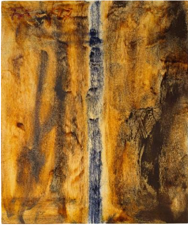
Günther Förg Untitled, 1997