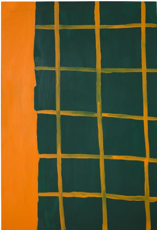
Günther Förg Untitled , 1994