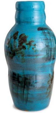
Günther Förg Untitled, 1996