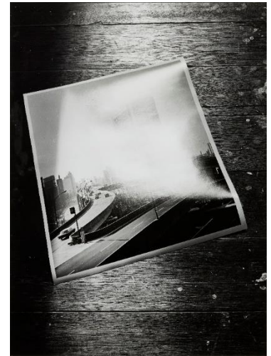
Jiro Takamatsu Photograph of Photograph , 1973 Estimate: $30,000-50,000

body, and the complexities of self-portraiture. While her life and career were short, her distinct body of work reveals her quick and impressive evolution as a photographer who drew inspiration from sources as varied as Surrealism, Conceptualism, and Post-Minimalism. Similarly influenced by these movements was Jiro Takamatsu whose dynamic practice established him as a leading influence in the Japanese conceptual art movement of the 1960s and 70s. In his Photograph of Photograph series, Takamatsu recontextualizes his own family photographs, elevating vernacular imagery to the level of fine art.