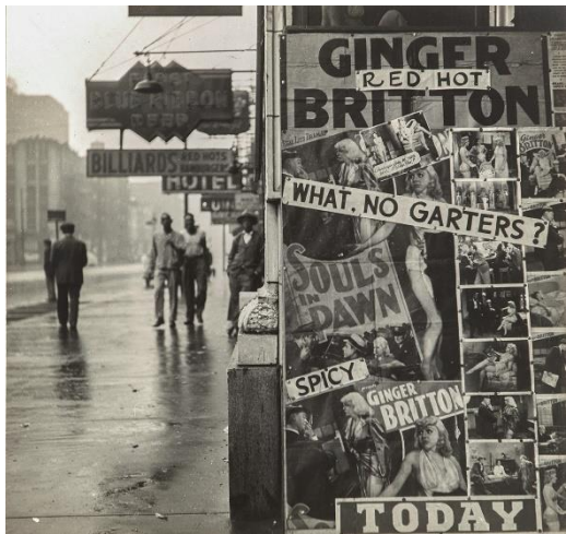
Walker Evans Chicago , 1947 Estimate $30,000 - 50,000

A strong selection of prints from the collection of the late New York gallerist Robert Schoelkopf (1927-1991) highlight Walker Evans' sensitive and astute portrayal of life during and after the great depression.