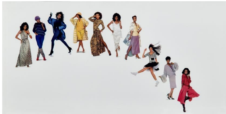
Hank Willis Thomas Alive with Pleasure! Chorus Line from Fair Warning, 2010 Estimate: $12,000 - 18,000