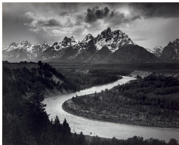
Ansel Adams The Tetons and the Snake River, Grand Teton National Park, Wyoming , 1942 Estimate: $100,000 - 150,000