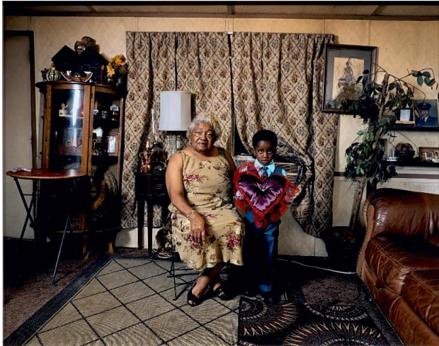
Deana Lawson Ring Bearer , 2016 Estimate: $25,000 - 35,000

Also among the highlights is Ring Bearer by Deana Lawson, winner of the 2021 Hugo Boss Prize and subject of an ongoing Guggenheim exhibition. While borrowing elements of documentary photography and portraiture, Deana Lawson's images are carefully crafted vignettes informed by her travels throughout the African diaspora. From the satin and lace ring pillow, to the family photos and play of textile patterns, every detail of Ring Bearer is full of intention and meaning.