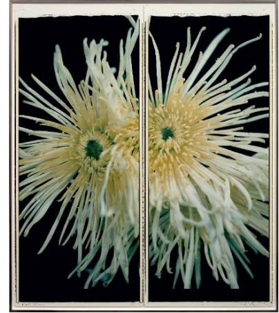
Chuck Close Fuji Mum, 1988 Estimate: $60,000-80,000