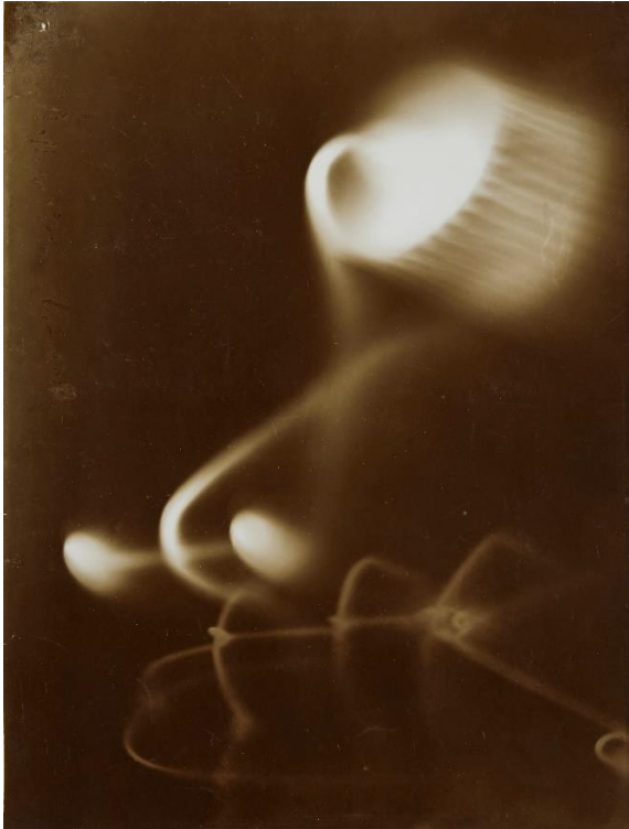
László Moholy-Nagy Photogram , 1920s Estimate: $300,000 - 500,000