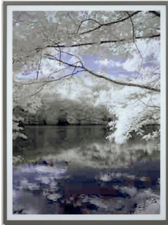
Thomas Ruff jpeg li01, 2007 Estimate $40,000 - 60,000