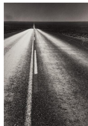
Robert Frank U.S. 285, New Mexico , 1956 Estimate: $80,000-120,000