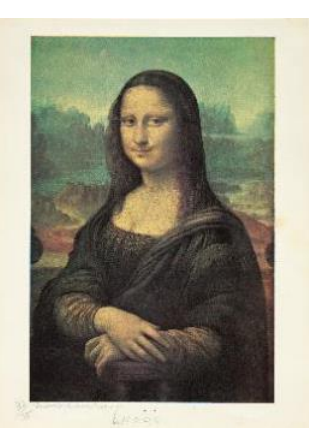
Marcel Duchamp L.H.O.O.Q, 1964 Estimate £200,000-300,000