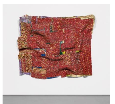
El Anatsui Plot a Plan IV , 2007 Estimate £650,000-850,000

Hailing from the collection of the esteemed architect and design pioneer Florence Knoll is Marino Marini's Piccolo Cavaliere . Executed in 1949 at the height or Marini's career, this bronze sculpture reflects the artist's raw and visceral vision of the symbiotic relationship between man and beast.