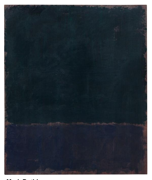
Mark Rothko Untitled (Black Blue Painting), 1968 Estimate: £2,500,000-3,500,000

LONDON – 18 MARCH 2021 – On 15 and 16 April, Phillips' London Spring auctions of 20th Century & Contemporary Art will include works by Modern, Post-War, Contemporary, and American masters. The Evening Sale will be held on 15 April at 5pm, with the Day Sale following on 16 April at 2:30pm. The catalogues for the Evening and Day sales will go live on 1 April with virtual viewing following from 7 to 11 April. The public viewing will be open at Phillips Berkeley Square from 12 to 15 April.