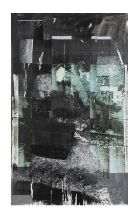
Adrian Ghenie Playing as bob, 2010 Estimate £250,000-350,000