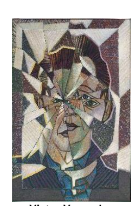
Victor Vasarely Autoportrait, 1944 Estimate £200,000-300,000 Estimate £180,000-250,000