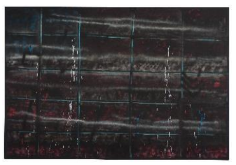
Sterling Ruby SP 151 , 2010 £250,000-350,000

Evening Sale: 15 April 2021, 5pm GMT Day Sale: 16 April 2021, 2:30pm GMT