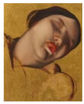
Tamara de Lempicka Figure esquissée sur fond doré, c. 1930 Estimate on request

Tamara de Lempicka's Figure esquissée sur fond doré, painted circa 1930, reflects a unique spectrum of art-historical influences including Cubism and Italian Mannerism, as well as the glamour of Hollywood films popular at that time. An Art Deco Icon, De Lempicka is known for pre-war society portraits featuring luminously smooth skinned aristocrats in gilded settings, as shown in the present work.