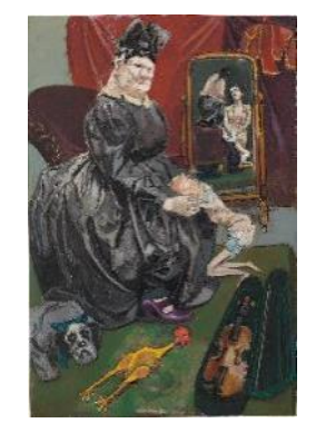
Paula Rego The Aunt (Nada), 2006 Estimate £800,000-1,200,000

Artists to feature in the Evening Sale who, like Dubuffet and Giacometti, have recently been or are soon to be the subject of major retrospectives are El Anatsui (Kunstmuseum Bern, 2020) and Paula Rego (Tate Britain, 2021). Paula Rego's The Aunt (Nada) depicts a scene inspired by Carmen Laforet's celebrated novel Nada about an orphaned girl who goes to study at her aunt's house. Rego's aunt is stern amongst a backdrop of objects and animals, a reflection of Rego's references to the novel as well as her ability to illustrate multiple emotions, stories and symbols in one composition.