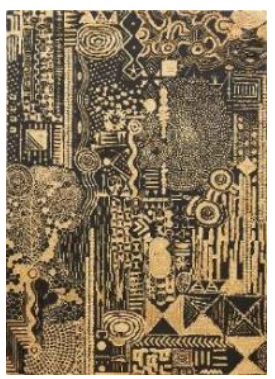
Lina Iris Viktor Constellations III, 2017 Estimate £30,000-50,000