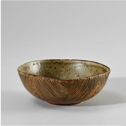
AXEL JOHANN SALTO Bowl, model no. 20728, designed circa 1944 Estimate £1.000 - 1.500