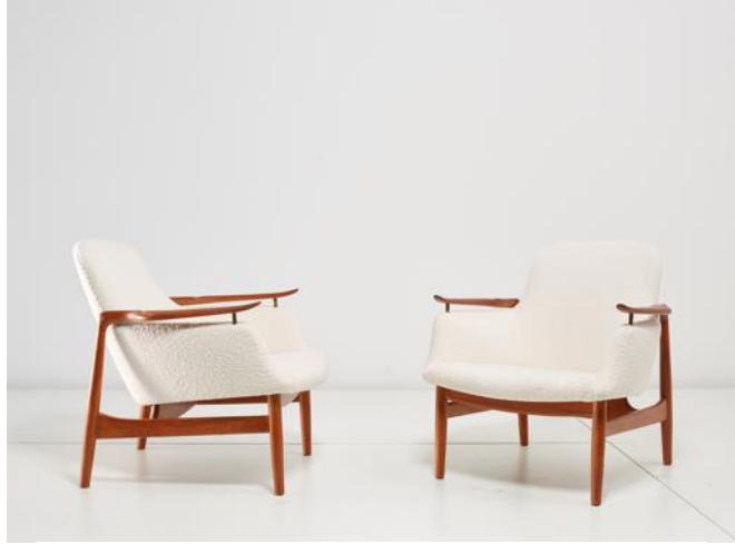
FINN JUHL Pair of easy chairs, model no. FJ 53, designed 1953 Estimate £15.000 - 20.000