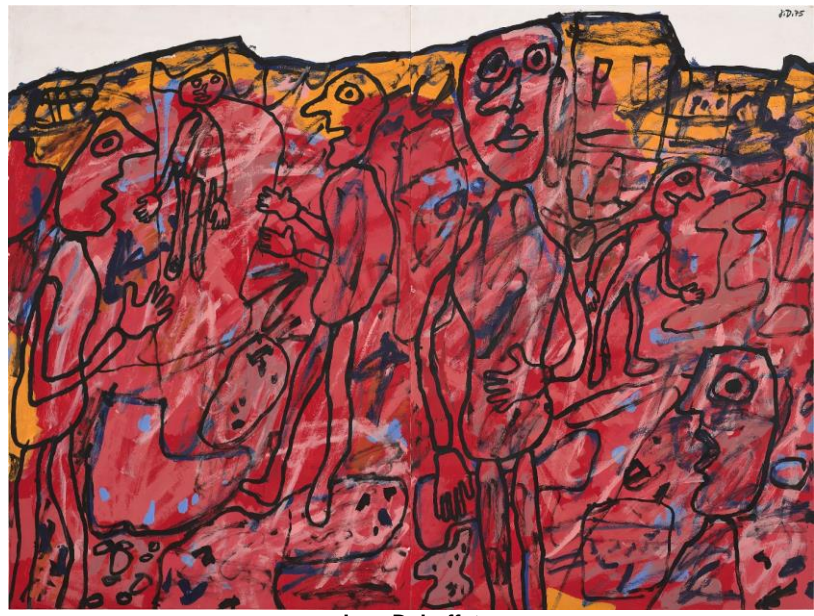
Jean Dubuffet Lieu rouge au château, 5 July 1975 Estimate: £700,000-1,000,000