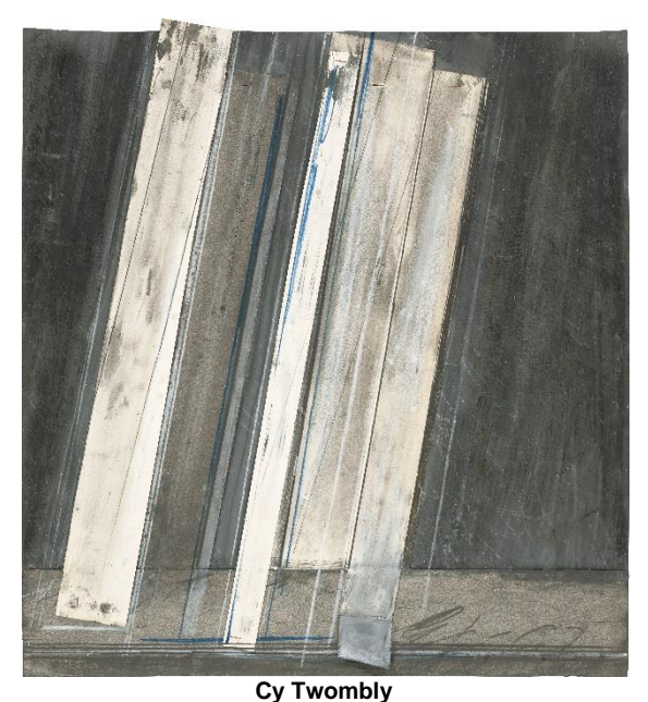
Untitled, 1973 Estimate: £800,000-1,200,000

Examples of earlier 20th century masterworks include Henri Matisse's Grand Nu accroupi (Olga) , conceived in 1909-1910 and cast in 1952. This sculpture is one of a numbered edition of 10, with distinguished examples held in some of the world's most prestigious private and institutional collections, including the Kunsthaus Zurich. The present work is a powerful example of Matisse's skill and strength as a sculptor. The model, Olga Meerson, herself an accomplished artist, shared a profound artistic connection with Matisse, their creative exchange immortalised through their respective works. This is complemented by other examples of Post-War sculpture including Polish artist Alina Szapocznikow's Autoportret II .