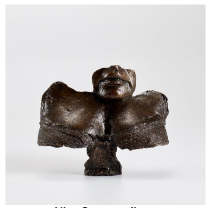
Alina Szapocznikow Autoportret II, 1966 Estimate: £250,000-350,000