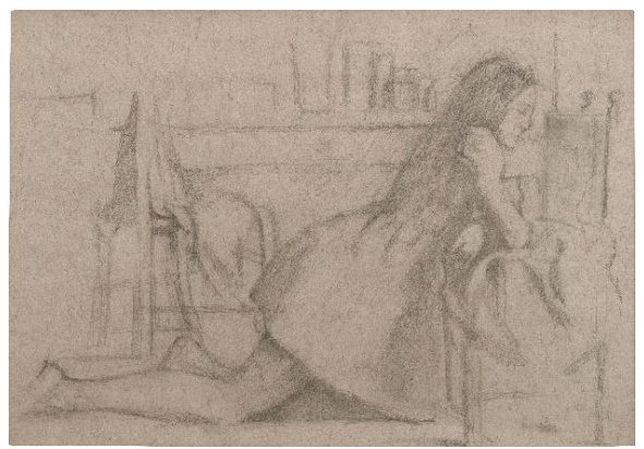
Balthus Étude pour 'Le Peintre et son modèle', 1977 Estimate: £280,000-400,000