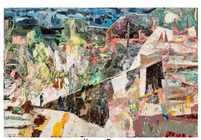
Hernan Bas His Voice Would be the Loudest in the Land, 2009 Estimate £450,000-650,000