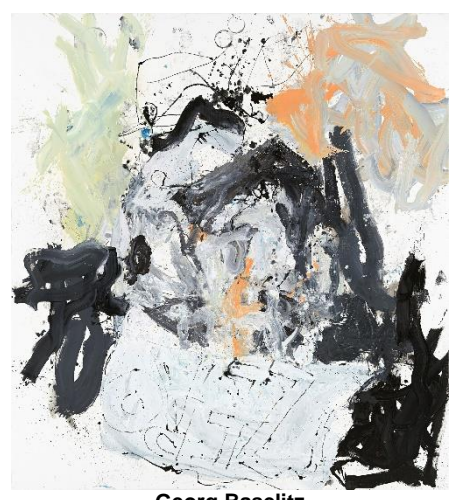
Georg Baselitz Raum licht wiln echt mehr (Rial blef well), 2013 Estimate: £300,000-500,000