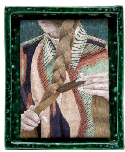
Klára Hosnedlová Untitled (from Ponytail Parlour), 2018 Estimate: £8,000-12,000