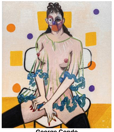
George Condo Seated Harlequin, 2007 Estimate: £750,000-950,000