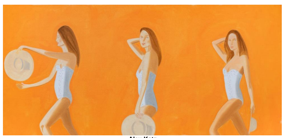
Alex Katz Ariel, 2016 Estimate: £650,000-850,000