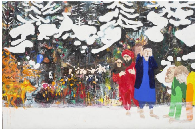
Daniel Richter Schakal Reloaded, 2009 Estimate: £300,000-500,000