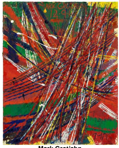
Mark Grotjahn Untitled (CAPRI 48.27) , 2016 Estimate: £300,000-500,000