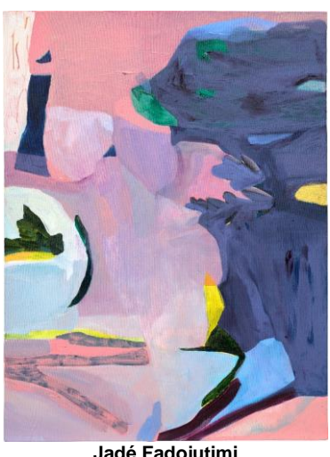
Jadé Fadojutimi Bark, 2016 Estimate: £70,000-100,000