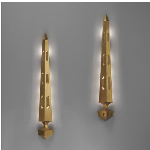
Gio Ponti Pair of wall lights, from the Time & Life Building, New York, circa 1959 Estimate $30,000 - 50,000

collaborating with U.S.-based manufacturers to bring Italian design to the American consumer. One work in the sale that represents this collaborative period is a pair of rare wall lights that Gio Ponti designed circa 1959 for the auditorium of the Time & Life Building in New York City. This design has never come to auction, making the lights an exciting discovery for any collector or enthusiast.