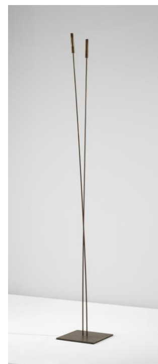
Harry Bertoia Untitled (Sonambient) , circa 1976 Estimate $50,000 - 70,000