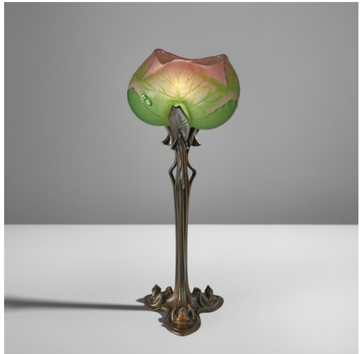
Daum Frères and Louis Majorelle "Nénuphar" table lamp, circa 1903 Estimate: $120,000 - 180,000