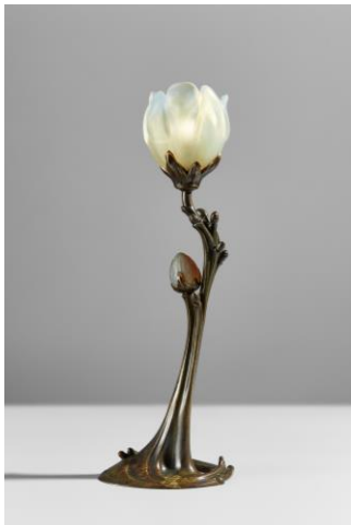
Daum Frères and Louis Majorelle "Magnolia" table lamp, 1904 Estimate $30,000 - 50,000

Phillips is also excited to offer a group of important French Art Nouveau lighting and furniture from a private collection. This collection comprises highly sought-after designs by renowned French designers who were pivotal during the turn of the 20th century, including Daum Frères, Louis Majorelle, Émile Gallé, Eugène Gaillard, and Georges de Feure. Many of these designs were included in various world expositions and are considered to be pinnacle examples of Art Nouveau design. Highlights on offer include a "Nénuphar" table lamp by Daum Frères and Louis Majorelle, a beautiful table lamp in the form of a water lily, as well as Louis Majorelle's "La Cascade" cabinet. Both of these pieces demonstrate a remarkable sense of dynamism and are emblematic of the art nouveau designers' fascination with portraying the natural world, utilization of contemporary materials, and exquisite craftsmanship.