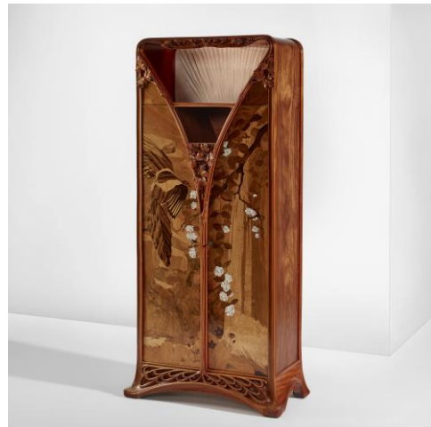
Louis Majorelle "La Cascade" cabinet, 1899 Estimate $60,000 - 80,000

Phillips is also excited to offer a group of important French Art Nouveau lighting and furniture from a private collection. This collection comprises highly sought-after designs by renowned French designers who were pivotal during the turn of the 20th century, including Daum Frères, Louis Majorelle, Émile Gallé, Eugène Gaillard, and Georges de Feure. Many of these designs were included in various world expositions and are considered to be pinnacle examples of Art Nouveau design. Highlights on offer include a "Nénuphar" table lamp by Daum Frères and Louis Majorelle, a beautiful table lamp in the form of a water lily, as well as Louis Majorelle's "La Cascade" cabinet. Both of these pieces demonstrate a remarkable sense of dynamism and are emblematic of the art nouveau designers' fascination with portraying the natural world, utilization of contemporary materials, and exquisite craftsmanship.