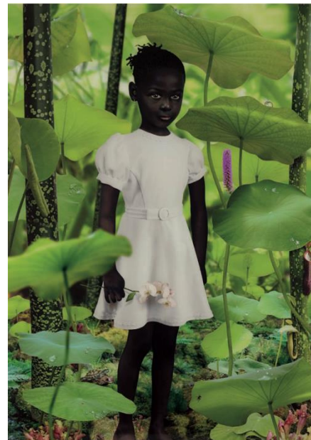
Ruud van Empel

Cimarron from The Becoming Subject , 2015 Estimate: £8,000-12,000