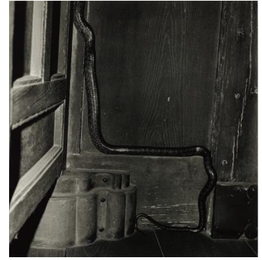
須田一政 Issei Suda

Apartment #7 横浜 泥亀 Deiki, Yokohama, 1977 Estimate: £8,000-12,000