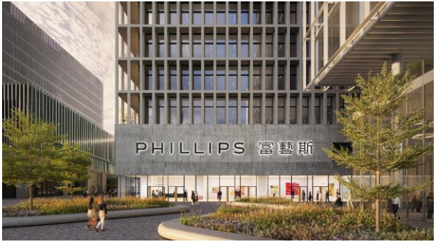
Rendering of the new Phillips Asia headquarters in Hong Kong's West Kowloon Cultural District

• In its eighth year, Phillips is entering into a new era in Asia in Spring 2023 with a spectacular new headquarters in the WKCDA Tower in Hong Kong's West Kowloon Cultural District, designed by Herzog & de Meuron and LAAB Architects. Situated immediately opposite to the world-class museum M+ and neighbouring the Hong Kong Palace Museum, the new Asia headquarters features over 50,000 square feet spreading a total of six floors, from the ground floor level to the fifth floor. Phillips will be the first auction house in Hong Kong to have a permanent purpose-built exhibition space, saleroom, café and VIP lounge, allowing for year-round events and auctions in its own space. The state-of-the-art galleries and saleroom will open with the exhibition of 20th