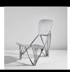
Joris Laarman "Bone" chair 2006