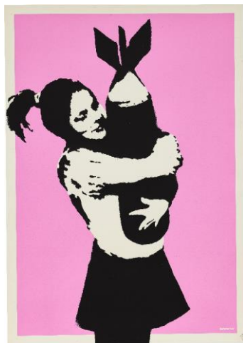
Banksy BOMB LOVE , 2004 screenprint in colours on wove paper Estimate: HK$ 60,000 - 80,000