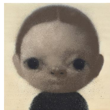
Roby Dwi Antono KIRANA , 2019 spraypaint on canvas Estimate: HK$ 40,000 - 60,000

24/7 Highlights Showcase: 9 to 18 October, 10am to 10pm Hong Kong Time