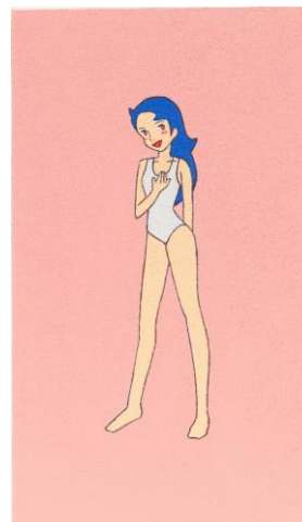
MR. Let's go by the airplane , 1998 acrylic on cotton Estimate: HK$ 40,000 - 60,000