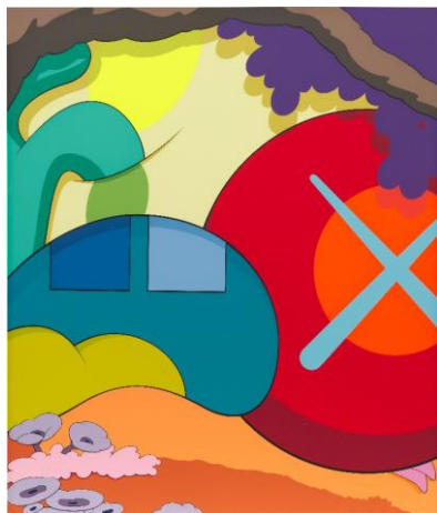
KAWS YOU SHOULD KNOW I KNOW , 2015 screenprint in colours on wove paper Estimate: HK$ 80,000 - 120,000