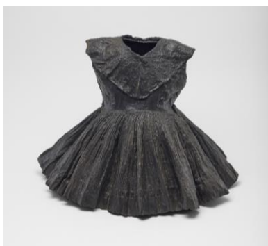
Marina Cruz Elisa in Black , 1982 Estimate: HK$ 50,000 - 80,000