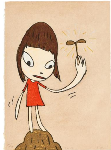
Yoshitomo Nara My Little Treasure , 2010 woodcut print Estimate: HK$ 100,000 - 200,000