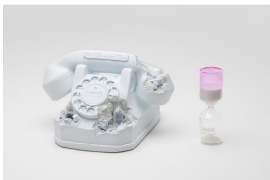
Daniel Arsham X Dior Eroded Telephone Future Relic , 2020 hydrostone and quartz crystals Estimate: HK$ 80,000 - 120,000