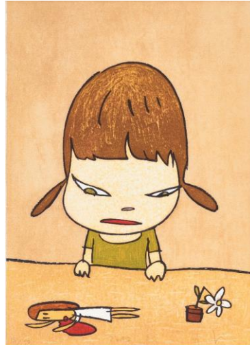
Yoshitomo Nara Broken Treasures , 2012 woodcut print Estimate: HK$ 100,000 - 200,000