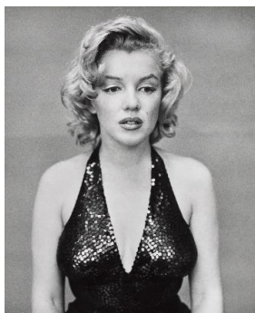
Richard Avedon Marilyn Monroe, actress, New York City, 5-6-57, 1957 Estimate: £50,000-70,000

Additional highlights from private collections feature works by renowned American photographers, including Richard Avedon, Irving Penn, Robert Mapplethorpe and Peter Beard.