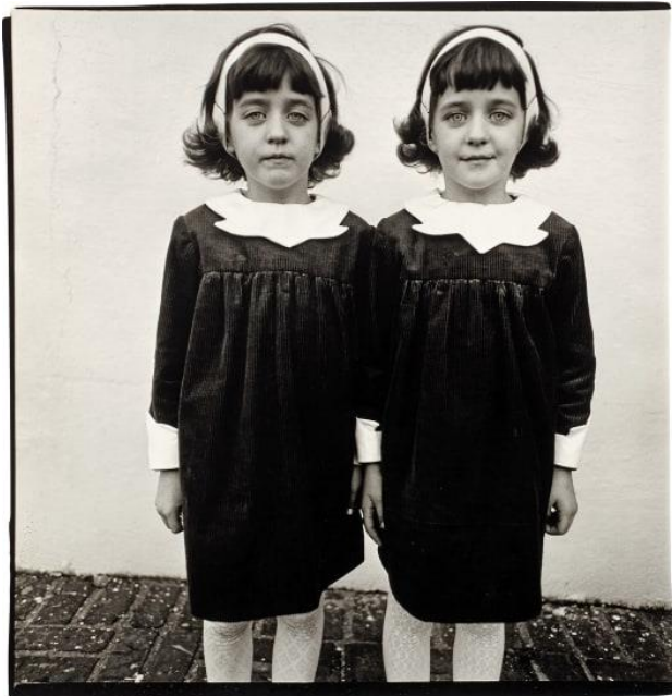
Diane Arbus Identical twins, Roselle, N.J., 1967, 1967-1969 Estimate: £400,000-600,000

Sale on 21 November to Feature Rare Works by Iconic 20th and 21st Century Photographers, Including Richard Avedon, Ikkō Narahara, and Hiroshi Sugimoto, Alongside ULTIMATE ELLEN VON UNWERTH