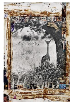
Peter Beard Female Gerenuk on the Tiva, Tsavo North, 1965 Estimate: £70,000-90,000

Leading the 20th edition of ULTIMATE, a unique platform dedicated to promoting creative collaborations and selling exceptional works available only at Phillips, is Ikkō Narahara's Two Garbage Cans, Indian Village, New Mexico , an iconic work from his acclaimed series Where Time Has Vanished . Captured in Acoma Pueblo—North America's oldest continuously inhabited settlement, known as "Sky City"—the image depicts two garbage cans suspended in the village square, placed high to protect them from roaming dogs and coyotes. As the key image from Where Time Has Vanished , this photograph was included in the landmark 1974 exhibition New Japanese Photography at New York's Museum of Modern Art and later appeared on the cover of the revised edition of the photobook. Further ULTIMATE highlights include works by Hiroshi Yamazaki, Mao Ishikawa and Fan Ho.