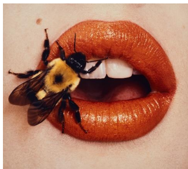
Irving Penn Bee (A), New York, September, 1995 Estimate: £40,000-60,000