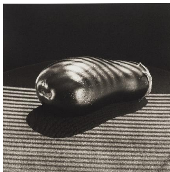
Robert Mapplethorpe Eggplant, 1985 Estimate: £30,000-50,000