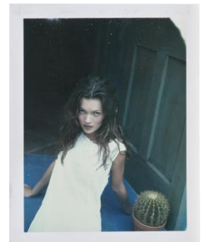
Ellen von Unwerth

ULTIMATE ELLEN VON UNWERTH highlights an exclusive selection of 16 unique Polaroids taken by the celebrated photographer Ellen von Unwerth. Created during editorial assignments for international publications, including Vogue US , Vogue Italia , and i-D , these works provide an insightful glimpse into the photographer's creative process, capturing defining and often behind-the-scenes moments during the supermodel heyday of the late 1980s to the early 2000s. These Polaroids feature some of the most prominent names in fashion, including Kate Moss, Claudia Schiffer, and Naomi Campbell.