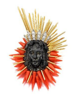
Schlumberger Tortoiseshell, Coral, and Diamond Clip-Brooch, circa 1956 Estimate: $12,000 – 15,000