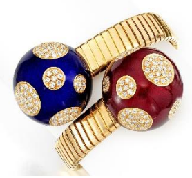
Bulgari Diamond and Enamel Bracelet, 'Tubogas' Estimate: $35,000 - 50,000