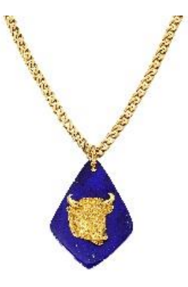
Cartier Lapis Lazuli Pendant Necklace Estimate: $22,000 – 32,0000

Georges Lenfant Ruby and Diamond Bracelet Estimate: $12,000 – 18,000