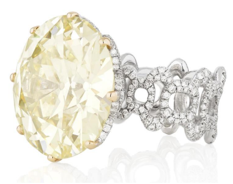
Impressive Fancy Yellow Diamond Ring featuring an old European brilliant-cut diamond weighing 43.15 carats Estimate: $550,000 – 850,000

Antique Cut Diamonds, Highly Collectible Jewels, and Standout Colored Gemstones Lead the Sale