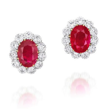
Pair of 10.77 & 9.99-carat Burmese Ruby and Diamond Ear Clips Estimate: HK$9,400,000 - 12,500,000/ US$1,200,000 - 1,600,000