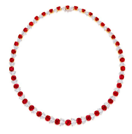
Burmese Ruby and Diamond Necklace, rubies totalling approximately 54.18 carats Estimate: HK$7,800,000 - 9,000,000/US$1,000,000 - 1,150,000