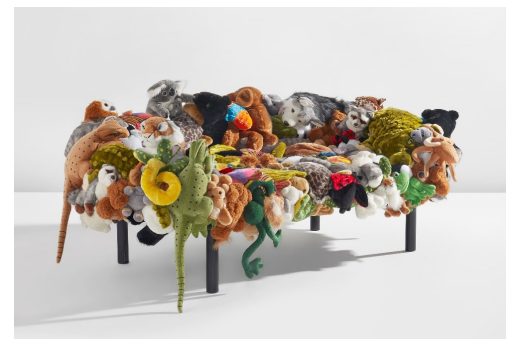
Fernando and Humberto Campana Rare "Animais Variados" sofa, 2003 Estimate $18,000 - 24,000