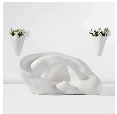
John Baldessari "Ear Sofa" and "Nose Sconces" , 2009 Estimate $150,000 - 200,000

John Baldessari's Ear Sofa and Nose Sconces , created in 2009, are standout pieces that blur the lines between art and functional design. These works, part of an edition of six produced by Beyer Projects, were designed for Baldessari's 2009 exhibition at the Museum Haus Lange in Germany and were also later installed in the Sprüth Magers Gallery in London as a performance piece involving a live actor seated on the sofa, smoking, with two white poodles on either side. The playful, yet thought-provoking, furniture pieces reflect Baldessari's fascination with human anatomy and his ability to transform everyday objects into profound artistic statements.