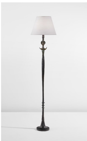
Alberto Giacometti "Figure" floor lamp , designed circa 1933, cast circa 1969 Estimate $200,000 - 300,000