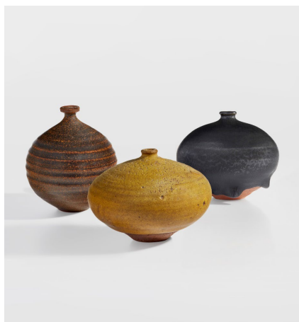
Doyle Lane Selection of three Weed pots , circa 1970 Estimate $4,000 - 6,000 each

Alongside the works of French designers are important examples from 20th Century Italian designers, including furniture by Gio Ponti and