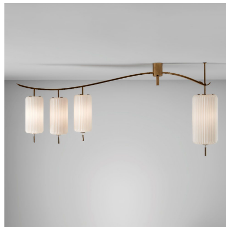
Angelo Lelii Rare ceiling light , circa 1959 Estimate $15,000 - 20,000