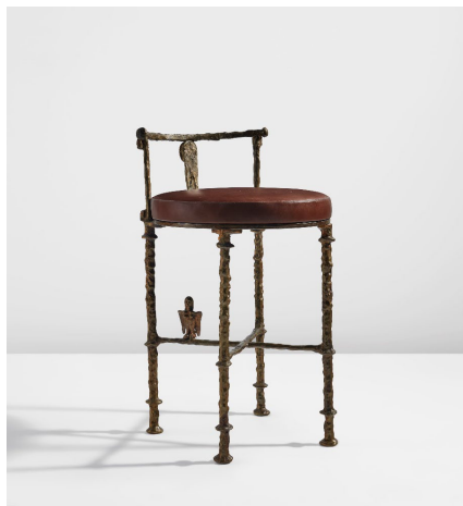
Diego Giacometti Tabouret à la harpie , circa 1977 Estimate $150,000 - 250,000