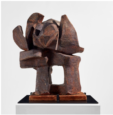
Peter Voulkos "Rasgado" , 1958 Estimate $300,000 - 500,000

Holding the highest two world auction records for Peter Voulkos , Phillips is proud to present Rasgado , a sculpture by the artist titled after the Spanish guitar technique and boasting the top lot position of the sale. Created in 1958, Rasgado marks a crucial early moment in Voulkos' career and exemplifies his innovative approach to ceramics, combining wheel throwing, slab construction, and abstract forms. This work, which has remained in the same family since its purchase from the artist in 1959, is making its first appearance on the market, underscoring its rarity and historical significance.