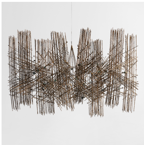
Harry Bertoia Untitled (Straw Form) , circa 1960 Estimate $100,000 - 150,000