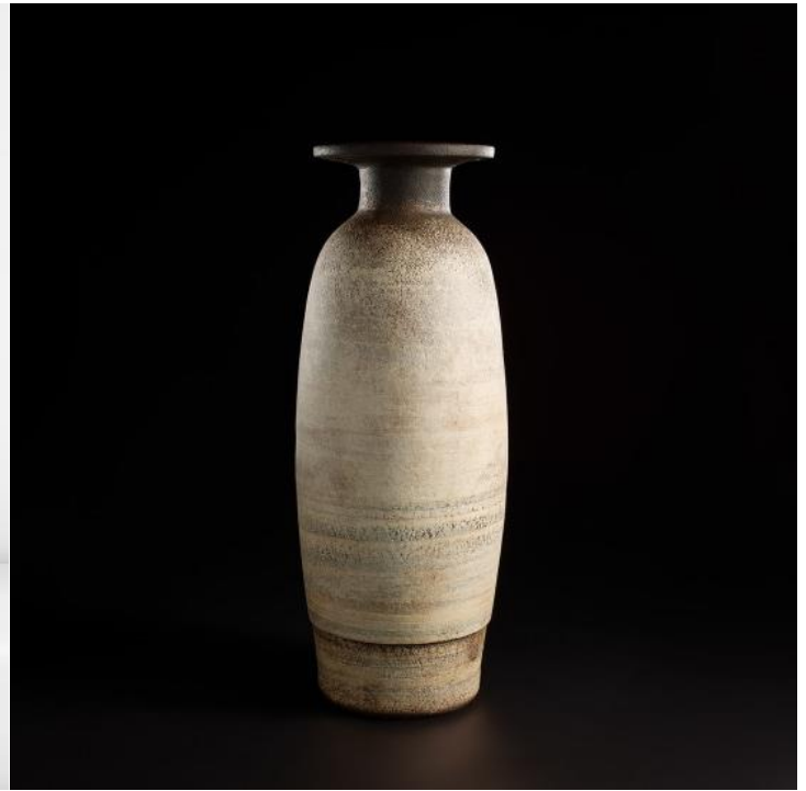
An Important Hans Coper from the Henry Moore Family Collection Hans Coper Monumental bottle with disc top , circa 1959 Estimate: £120,000 - 180,000

LONDON – 4 APRIL 2023 – Phillips is pleased to announce highlights from the London Design auction, taking place on 26 April. This sale brings together rare and important works of 20th and 21st century design, including, among others, designs by François-Xavier Lalanne, Gio Ponti, Hans Coper, Børge Mogensen, and Paul Dupré-Lafon. Comprising 140 lots, highlights from the sale will be on view at Phillips' London galleries on Berkeley Square galleries from 20 April until the auction on 26 April at 2pm. On the following day, 27 April at 1pm, there will be an auction dedicated to Casa Fornaroli .