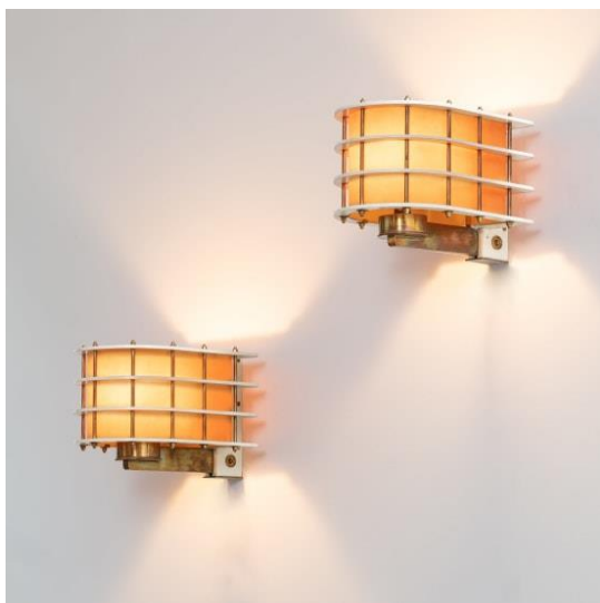
Paul Dupré-Lafon Pair of wall lights , designed circa 1949, produced circa 1955 Estimate: £20,000 - 30,000

Included in the sale are a selection of Art Deco works from 20th century French designer Paul Dupré-Lafon. The six lots offered here were commissioned directly from Dupré-Lafon and have stayed in the same family ever since. The works are remarkable given that it is rare for a comprehensive collection of this sort to come to market. Having trained as a painter, Dupré-Lafon went on to focus on architecture and design, working for a time for Hermès where he designed furniture, lights, and accessories. The coffee table and pair of wall lights highlighted here are notable examples of the designer's ability to marry simple functional forms with sumptuous materials, accented by painted metal.