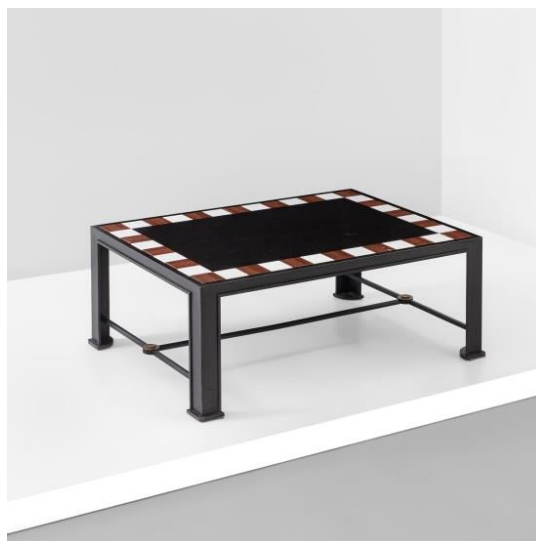
Paul Dupré-Lafon Coffee table , designed circa 1949, produced circa 1955 Estimate: £30,000 - 50,000