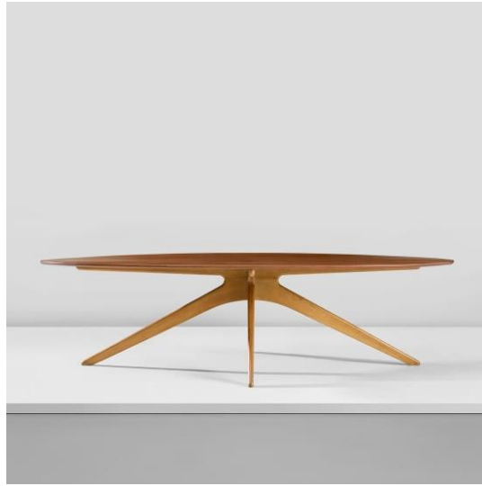
Børge Mogensen Rare dining table, circa 1950 Estimate: £25,000 - 35,000