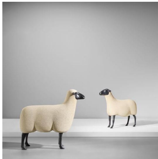
François-Xavier Lalanne 'Mouton de Pierre' and 'Mouton Transhumant', designed 1979 and 1988, executed 1993 Estimate: £250,000 - 350,000

Leading the sale are two lots by François-Xavier Lalanne; his 1999 'Grand Bouquetin', and his 1993 'Mouton de Pierre' and 'Mouton Transhumant'. François-Xavier and his wife and fellow artist Claude had a very dynamic approach to combining decorative and fine arts. Known collectively as 'Les Lalanne', they were inspired by nature, flora, and fauna and are regarded as having revolutionised design in the 20th century. During his career François-Xavier took up the challenge of sculpting many different animal forms, resulting in a fantastic menagerie of creatures that bridge art and design. None are more celebrated than the artist's beloved mountain goat 'Grand Bouquetin' and his regal sheep 'Moutons', both of which were integral to the designer's fantastical bestiary. These elegant creatures are magnificent examples of the artist's love for illustrating the animal kingdom.