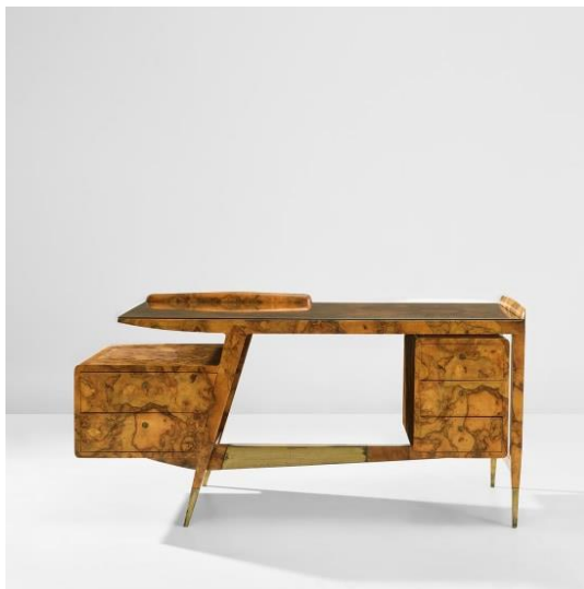
Property from a Milanese Estate Gio Ponti Desk from Casa di Fantasia, Milan, circa 1951 Estimate: £80,000 - 120,000