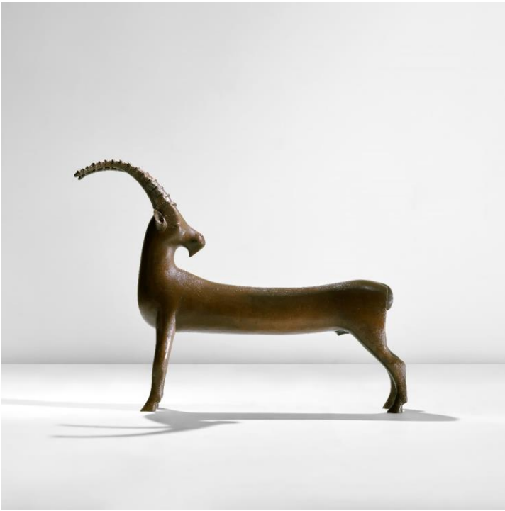
François-Xavier Lalanne 'Grand Bouquetin' , 1999 Estimate: £500,000 - 700,000

Alongside an Important Hans Coper from the Henry Moore Family Collection