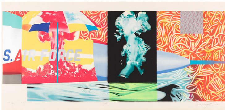
James Rosenquist, F-111 (south) (west) (north) (east) (G. 73) , 1974 SOLD FOR $228,600