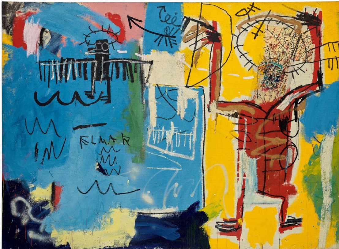
Jean-Michel Basquiat Untitled (ELMAR) , 1982 68 x 93 1/8 in. (172.7 x 236.5 cm) Estimate: $40-60 million To be Offered on 14 May in New York

Monumental 1982 Masterwork Leads the Group, Estimated at $40-60 Million