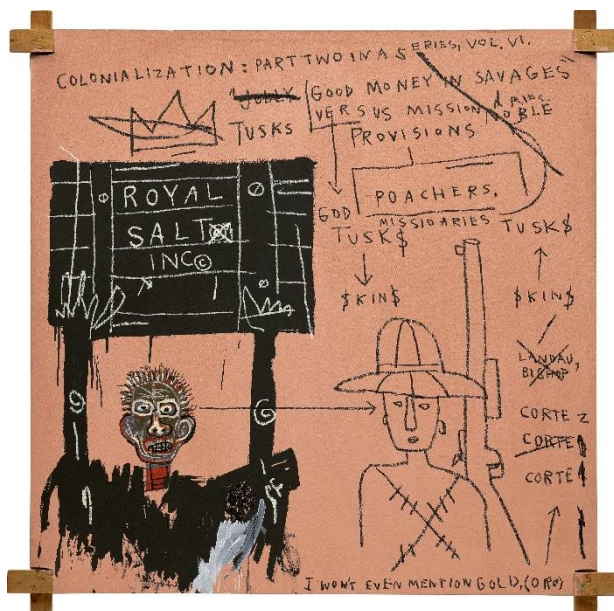
Jean-Michel Basquiat Native Carrying Some Guns, Bibles, Amorites on Safari, 1982 72 1/8 x 71 3/4 in. (183.2 x 182.2 cm) Estimate: $12-18 Million / HK$90-120 Million To be offered on 31 May in Hong Kong

Since Phillips became a key operator in Asia in 2015, the company has been dedicated to presenting the best Western artworks to collectors and enthusiasts in the region. The company's significant growth in Asia underscores the activity of Asian collectors acquiring works by the most important international artists. Jean-Michel Basquiat is a perfect example of this, with collectors in Asia being drawn to the artist's oeuvre, which resonates deeply with the region's rich artistic traditions. In 2022, Phillips sold Untitled, 1982 , from the collection of Japanese entrepreneur Yusaku Maezawa, with the buyer also being a private collector in Asia. Given Basquiat's enduring appeal and resonance in Asia, Phillips is pleased to offer Native Carrying Some Guns, Bibles, Amorites on Safari, 1982 , at Phillips Hong Kong on 31 May.