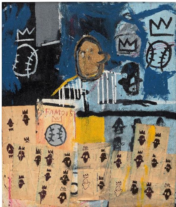
Jean-Michel Basquiat Untitled (Portrait of a Famous Ballplayer) , 1981 50 1/8 x 43 1/2 in. (127.3 x 110.5 cm) Estimate: $6.5-8.5 Million To be offered on 14 May in New York

Leading the group of works being offered is Untitled (ELMAR) , created in 1982 and acquired by the Pellizzi Family just two years later [illustrated page one]. At nearly eight feet wide, the monumental work is a cornerstone of Basquiat’s golden year, during which he transitioned from street art to gallery success. Emblematic of Basquiat’s best works, Untitled (ELMAR) is rich in iconography and self-referential imagery. On the left, a “fallen angel” figure, birdlike and adorned with the recurring crown-of-thorns motif—which doubles as a halo—hovers above a luminous blue sea of scribbled waves and the text “ELMAR”, suggesting a modern-day Icarus on the verge of descent. To the right, a radiant archer, also crowned, releases two arrows in his direction. Untitled (ELMAR) ultimately reflects Basquiat’s exploration of duality within his own identity and encapsulates the essence of the artist at the peak of his creative powers.