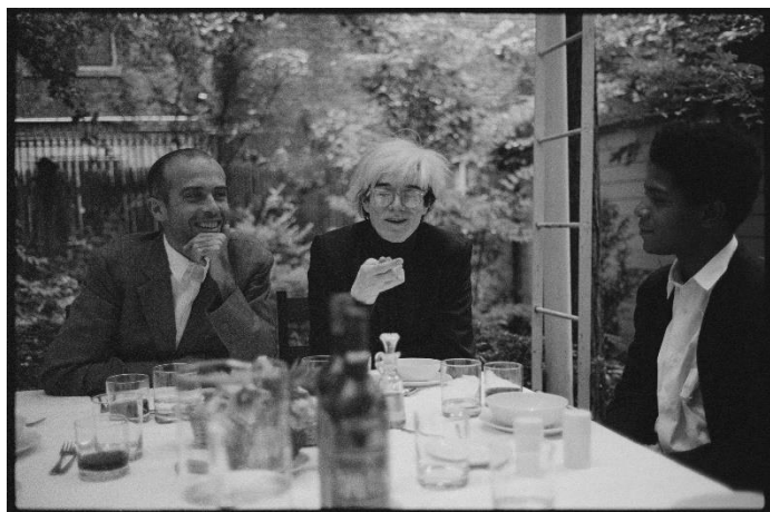
Francesco Clemente, Andy Warhol, and Jean-Michel Basquiat at the Pellizzi residence in New York, NY, 1984

In this work, a Black figure dominates the canvas with its arms raised, confronting a colonial poacher. The artwork merges intricate draftsmanship with street art gestures and takes on such significant subjects such as slavery and empire. Through a direct portrayal and the incorporation of text, Basquiat critiques colonial commerce, encapsulating his broader themes of colonization, commercialization, and African American history. Reduced to caricatures, the figures symbolize "native" and "colonizer", evoking explicit critiques of white imperialism. Native Carrying Some Guns, Bibles, Amorites on Safari reflects Basquiat's acute awareness of societal issues and stands as an emblematic representation of his oeuvre, capturing the intensity of his artistic vision.