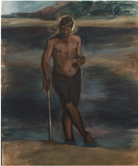
Lynette Yiadom-Boakye b. 1977 Luminary , 2011 Estimate: £250,000-450,000