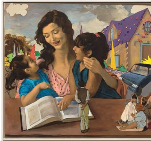
Salman Toor b. 1983 Aashiana (Hearth and Home) , 2012 Estimate: £30,000-50,000