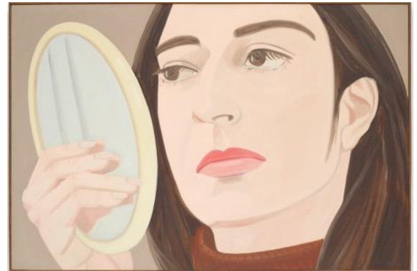
Alex Katz b. 1927 Ada with Mirror , 1969 Estimate: £400,000-600,000