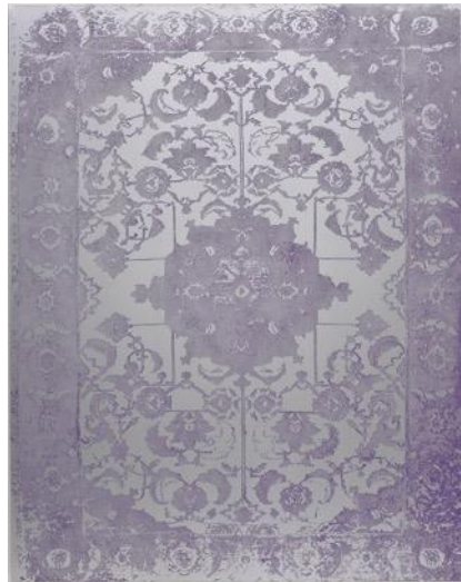
Rudolf Stingel b. 1956 Untitled , 2011 Estimate: £800,000-1,200,000