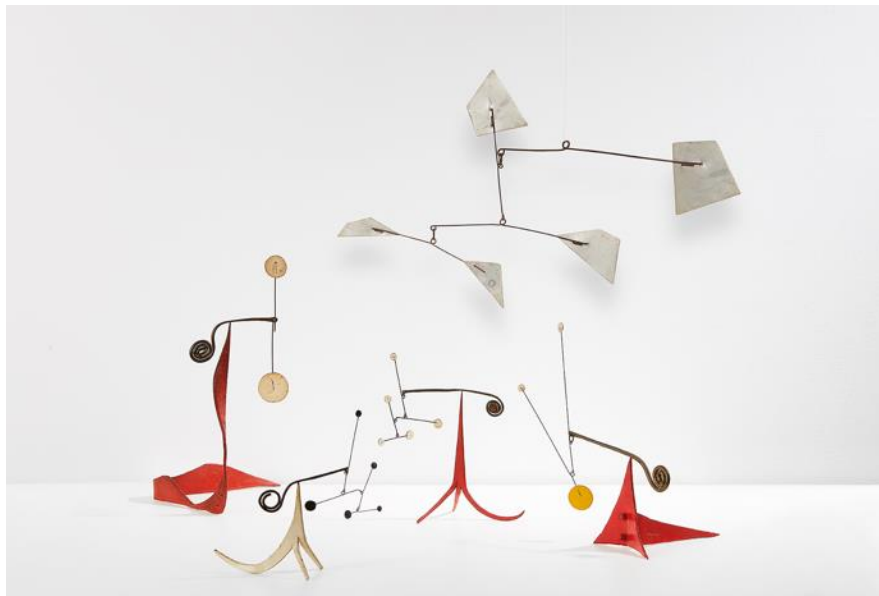
Property from An Important Private Collection, Paris

the sculptural medium's conventional methods of static presentation. Executed between 1954 and 1975, these sculptures took form at a pivotal time in Calder's career as the artist was gaining increasing critical attention.