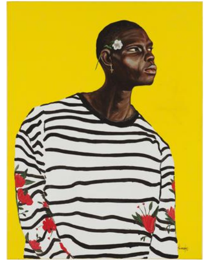
Otis Kwame Kye Quaicoe b. 1990 Black Stripes on White , 2019 Estimate: £20,000-30,000