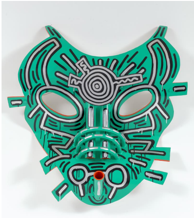
Keith Haring 1958-1990 Untitled (Grace Jones Mask), 1987 Estimate: £1,500,000-2,000,000