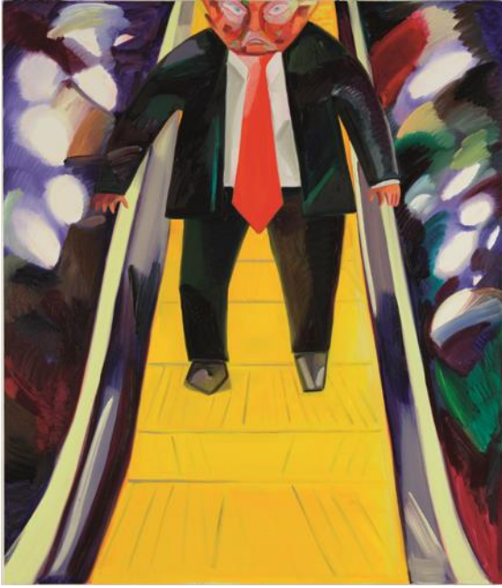
Dana Schutz b. 1976 Trump Descending an Escalator, 2017 Estimate: £380,000-580,000