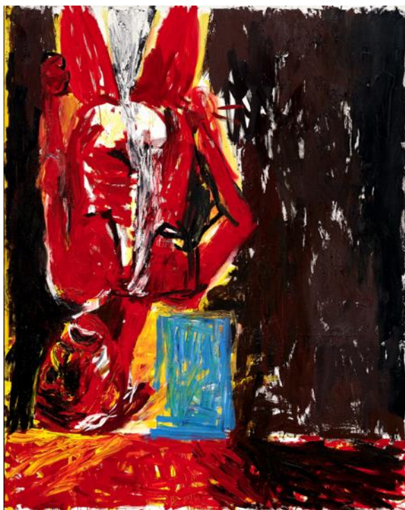
Georg Baselitz b. 1938 Das letzte Selbstbildnis I, 1982 Estimate: £4,700,000-6,000,000

Other notable highlights in this selection include a 2003 c-print by Wolfgang Tillmans titled Freischwimmer 27 (estimate: £210,000-300,000), and two Albert Oehlen works, Die Veränderungen executed in 2005 (estimate: £700,000-900,000), and Control executed in 2007 (estimate: £400,000-600,000).