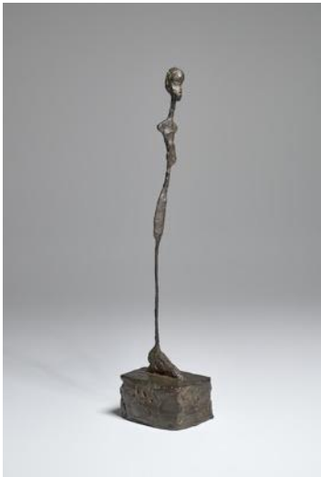
Alberto Giacometti 1901-1966 Femme debout , conceived circa 1961 and cast in bronze in 1993 Estimate: £550,000-750,000