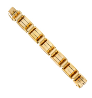
Gold Bracelet Estimate $4,000 — 6,000