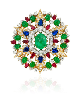
114 David Webb Gem-set and Diamond Brooch/... Estimate $20,000 — 30,000