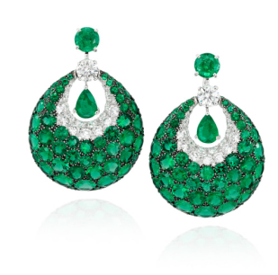
Graff Pair of Emerald and Diamond E... Estimate $65,000 — 85,000