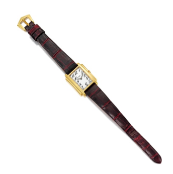
32 Patek Philippe Gold Wristwatch, 'Gondolo' Estimate $4,000 - 8,000