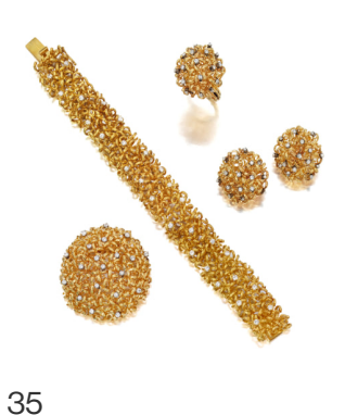
Suite of Gold and Diamond Jewe... Estimate $8,000 — 12,000