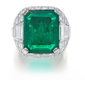
51 Bulgari Emerald and Diamond Ring, 'Tr... Estimate $70,000 — 90,000