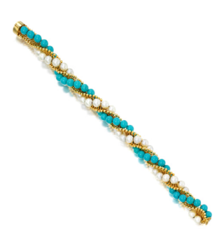
38 Van Cleef & Arpels Turquoise and Cultured Pearl Br... Estimate $5,500 — 7,500