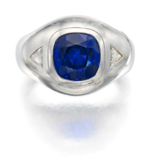
31 Gübelin Sapphire and Diamond Ring Estimate $50,000 — 80,000

New York Auction / 13 December 2022 / 10am EST