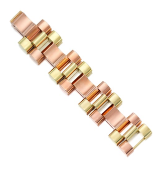
Tiffany & Co. Gold Bracelet Estimate $2,000 - 4,000