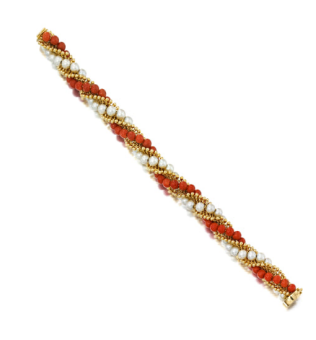
Van Cleef & Arpels Coral and Cultured Pearl Bracel... Estimate $5,500 - 7,500