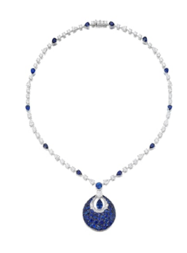
112 Graff Sapphire and Diamond Pendent... Estimate $40,000 - 60,000