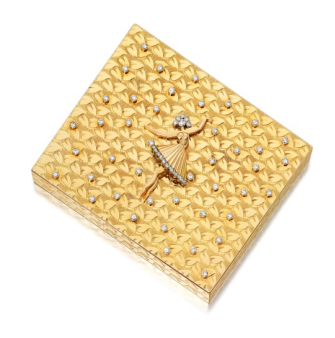
39 Van Cleef & Arpels Gold and Diamond Compact, 'B... Estimate $30,000 — 40,000