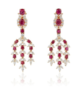
A Pair of Ruby, Diamond, and G... Estimate $18,000 — 26,000