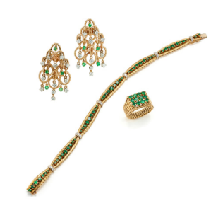
A Group of Emerald, Diamond, ... Estimate $2,500 — 4,500