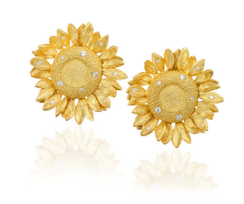
519 Asprey A Pair of Diamond and Gold 'Su... Estimate $2,600 — 3,000