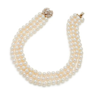
536 Mounted by Cartier A Cultured Pearl and Diamond ... Estimate $6,000 — 10,000