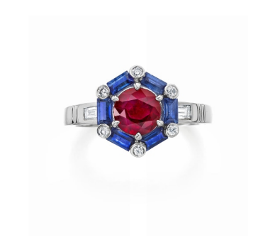
A Ruby, Sapphire, Diamond and... Estimate $2,500 — 5,000