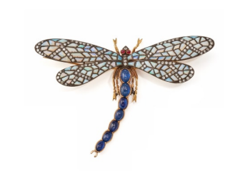
A Sapphire, Opal, Moonstone, D... Estimate $2,600 — 3,200