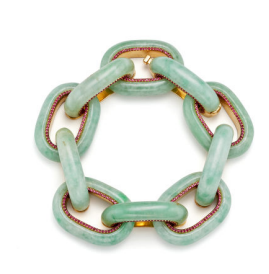
532 Seaman Schepps A Jade, Ruby, and Gold 'Bodrum... Estimate $10,000 — 15,000