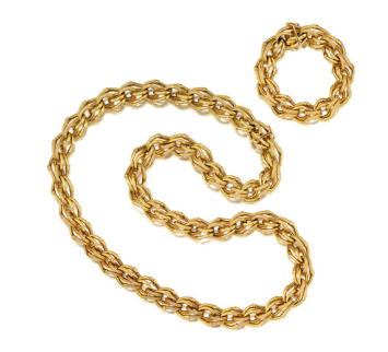
A Set of Gold Jewelry Estimate $8,000 — 12,000