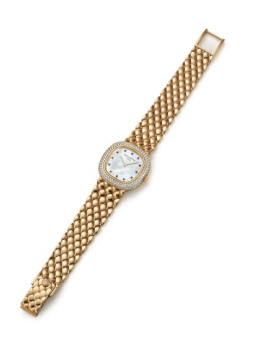
531 Patek Philippe A Mother-of-Pearl, Diamond, sa... Estimate $12,000 — 18,000