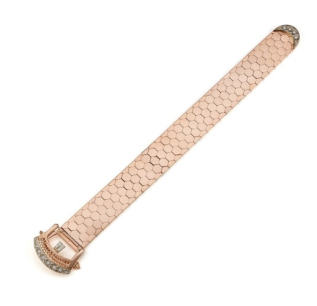
A Diamond and Bi-Colored Gold ... Estimate $3,000 — 5,000