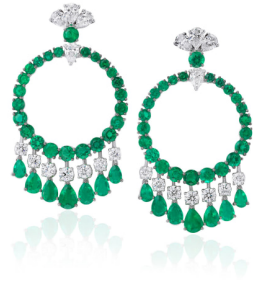
62 Graff A Pair of Emerald, Diamond, an... Estimate $50,000 — 70,000