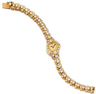
6 Van Cleef & Arpels A Diamond and Gold Wristwatch Estimate $20,000 — 30,000