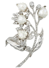
40 A Tennessee River Pearl, Diamo... Estimate $10,000 — 15,000