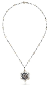
17 Cartier A Natural Pearl, Enamel, Diamo... Estimate $10,000 — 15,000