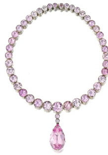
33 An Antique Pink Gemstone and ... Estimate $40,000 — 60,000