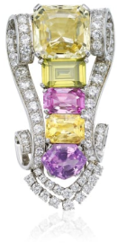
56 Oscar Heyman & Brot... A Multi-Colored Sapphire, Synt... Estimate $15,000 — 20,000