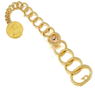
105 Salvador Dalí for Piaget A Modern Gold 'Dali d'or' Wrist... Estimate $10,000 — 15,000