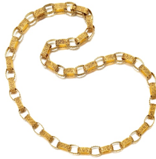
13 An Antique Gold Necklace Estimate $6,000 — 8,000