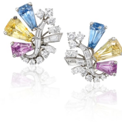
53 Oscar Heyman & Brot... A Pair of Multi-Colored Sapphir... Estimate $6,000 — 8,000