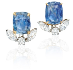
55 Oscar Heyman & Brot... A Pair of Sapphire, Diamond, Pl... Estimate $10,000 — 15,000