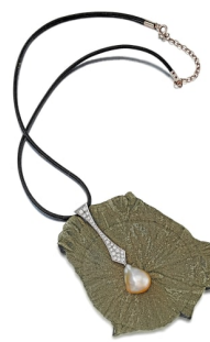
108 Grima A Fossilized Sand Dollar, Diamo... Estimate $4,000 — 6,000