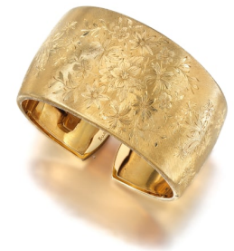
10 Buccellati A Gold Cuff Bracelet Estimate $8,000 — 12,000