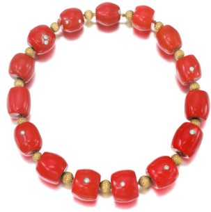
102 A Coral, Colored Diamond, Diam... Estimate $30,000 — 50,000