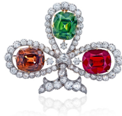
32 Kirkpatrick An Antique Multi-Colored Garne... Estimate $6,000 — 8,000