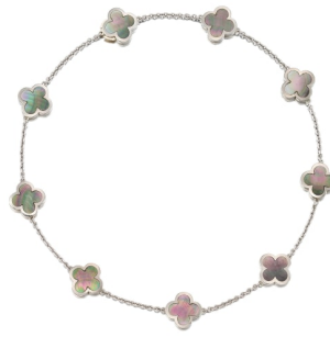
3 Van Cleef & Arpels A Mother-of-Pearl and White G... Estimate $8,000 — 12,000