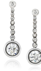
19 An Antique Pair of Diamond, Pl... Estimate $12,000 — 18,000