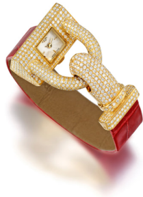
7 Van Cleef & Arpels A Diamond and Gold 'Cadenas' ... Estimate $30,000 — 50,000