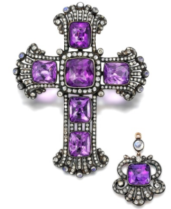
35 An Antique Amethyst, Moonsto... Estimate $4,000 — 6,000