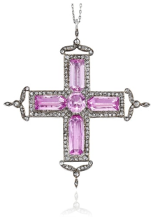
36 An Antique Pink Gemstone, Dia... Estimate $4,000 — 6,000