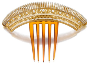
12 An Antique Pearl and Gold Tiara Estimate $7,000 — 9,000