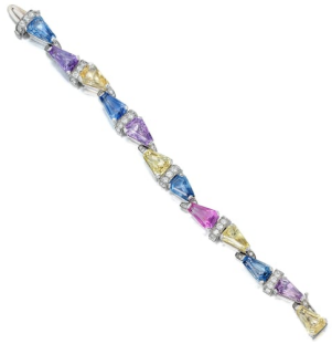
51 Oscar Heyman & Brot... A Multi-Colored Sapphire, Spine... Estimate $15,000 — 20,000

New York Auction / 6 December 2021 / 5pm EST