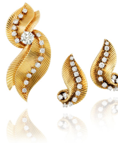
58 Cartier A Pair of Diamond and Gold Ear... Estimate $12,000 — 18,000