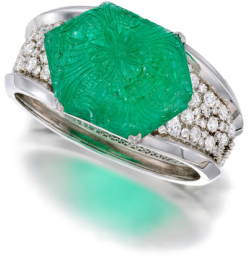
101 Paul Flato A Superb Carved Emerald, Diam... Estimate $300,000 — 500,000

New York Auction / 6 December 2021 / 5pm EST