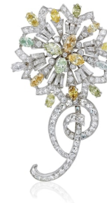
39 Tiffany & Co. A Colored Diamond, Diamond, a... Estimate $20,000 — 30,000