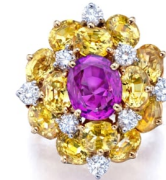
69 Oscar Heyman A Multi-Colored Sapphire, Diam... Estimate $5,000 — 7,000