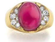
60 Oscar Heyman & Brot... A Ruby, Diamond, and Gold Ring Estimate $24,000 — 30,000