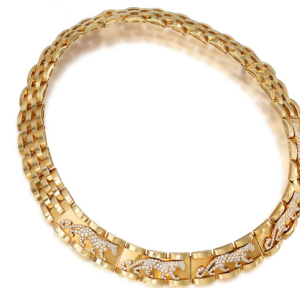
9 Cartier A Diamond and Gold 'Mahango'... Estimate $20,000 — 30,000