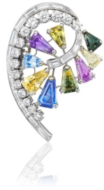
52 Oscar Heyman & Brot... A Multi-Colored Sapphire, Diam... Estimate $6,000 — 8,000