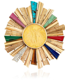
103 A Multi-Colored Hardstone, Dia... Estimate $5,000 — 7,000