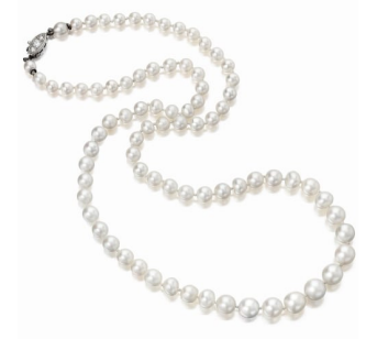
15 Tiffany & Co. An Art Deco Natural Pearl, Dia... Estimate $12,000 — 15,000