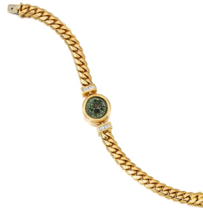
8 Bulgari A Diamond and Gold 'Monete' B... Estimate $5,000 — 7,000