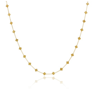
5 Van Cleef & Arpels A Gold 'Vintage Alhambra' Neck... Estimate $13,000 — 16,000