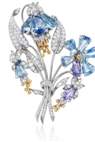
54 Oscar Heyman & Brot... A Sapphire, Colored Diamond, D... Estimate $20,000 — 30,000