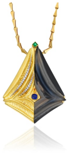
106 Grima A Smokey Quartz, Diamond, Em... Estimate $3,000 — 5,000