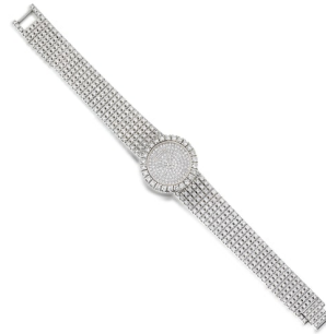
63 Patek Philippe A Diamond and White Gold Wris... Estimate $20,000 — 30,000