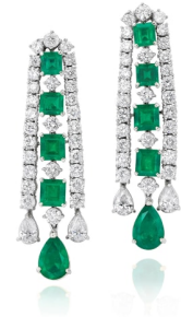
65 Piranesi A Pair of Emerald, Diamond, an... Estimate $30,000 — 50,000