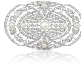
14 A Natural Pearl, Diamond and ... Estimate $6,000 — 8,000