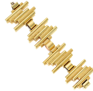
104 A Gold Bracelet Estimate $4,000 — 6,000