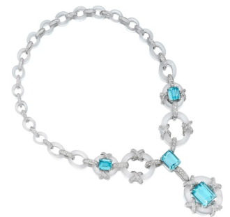
110 Attributed to Kutchinsky An Aquamarine, Rock Crystal, D... Estimate $40,000 — 50,000