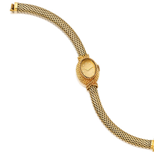
59 Boucheron A Gold Wristwatch Estimate $3,000 — 5,000