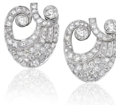
38 An Art Deco Pair of Diamond an... Estimate $6,000 — 8,000