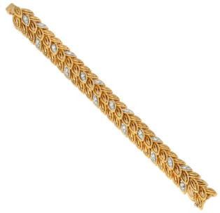
61 Van Cleef & Arpels A Diamond, Platinum, and Gold ... Estimate $8,000 — 12,000

New York Auction / 6 December 2021 / 5pm EST