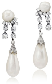
16 A Pair of Natural Pearl, Diamon... Estimate $10,000 — 15,000