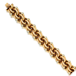
109 An Bi-Colored Gold Bracelet Estimate $5,000 — 7,000