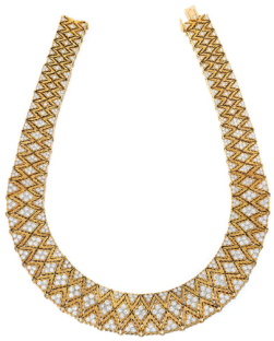
11 Mario Buccellati A Gold and Diamond Necklace Estimate $70,000 — 90,000

New York Auction / 6 December 2021 / 5pm EST