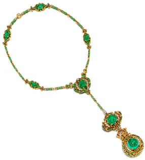
31 Marcus & Co. An Arts & Crafts Emerald, Diam... Estimate $100,000 — 150,000

New York Auction / 6 December 2021 / 5pm EST