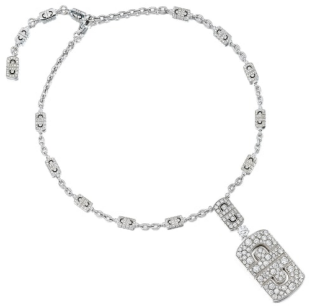
1 Bulgari A Diamond and Gold 'Parentesi' ... Estimate $12,000 — 16,000