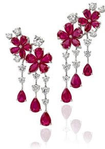
67 Graff A Pair of Ruby, Diamond, and W... Estimate $30,000 — 40,000