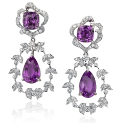
70 A Pair of Purple Sapphire, Diam... Estimate $10,000 — 15,000