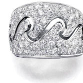
4 Van Cleef & Arpels A Diamond and White Gold Ring Estimate $6,000 — 8,000