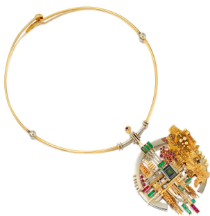
107 Arnaldo Pomodoro A Tourmaline, Ruby, Emerald, a... Estimate $5,000 — 7,000