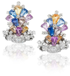
57 Oscar Heyman & Brot... A Pair of Multi-Colored Sapphir... Estimate $15,000 — 20,000