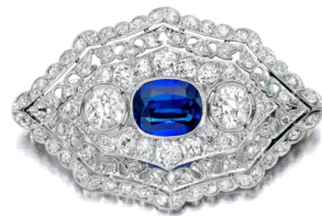
37 An Art Deco Sapphire, Diamond... Estimate $4,000 — 6,000