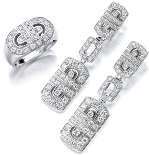
2 Bulgari A Pair of Diamond and Gold 'Par... Estimate $6,000 — 8,000