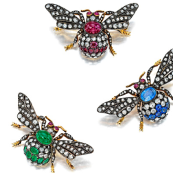
34 A Set of Sapphire, Emerald, Rub... Estimate $10,000 — 15,000