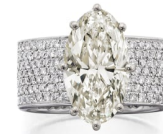
64 A Diamond and White Gold Ring Estimate $9,000 — 12,000