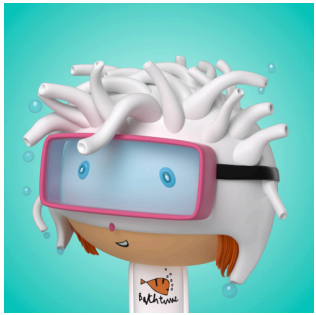
1 艾得佳·普連斯 《#4751 (洗澡時間)》 估價