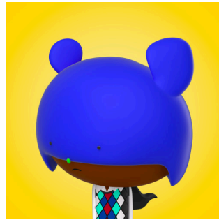
3 艾得佳·普連斯 《#4739》 估價