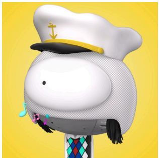
5 艾得佳·普連斯 《#4758》 估價