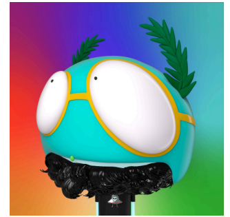
5 艾得佳·普連斯 《#4758》 估價