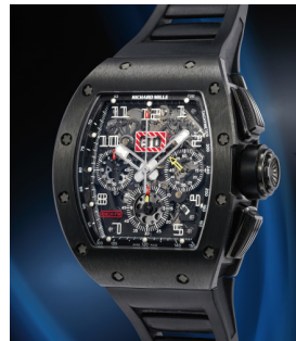
188 Richard Mille Richard Mille ，非常精細罕有，... 估價 90,000 — 180,000 CHF