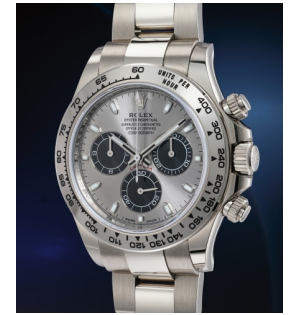
115 Rolex 勞力士，罕有精美，白金計時鏈... 估價 25,000 — 50,000 CHF