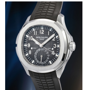
120 Patek Philippe 百達翡麗，精細，精鋼腕錶，備... 估價 40,000 — 80,000 CHF