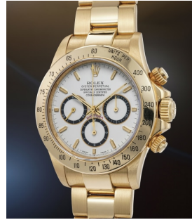
62 Rolex 勞力士，精美，黃金計時鏈帶腕... 估價 25,000 — 50,000 CHF