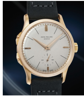
212 Patek Philippe 百達翡麗，非常罕有、十分優雅... 估價 120,000 — 250,000 CHF