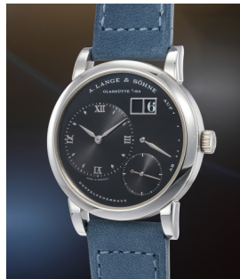
7 A. Lange & Söhne 朗格，罕有精美，鉑金腕錶，備... 估價 25,000 — 50,000 CHF