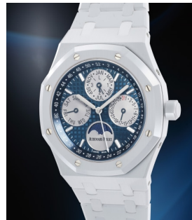
177 Audemars Piguet 愛彼，精細，白色陶瓷萬年曆鏈... 估價 150,000 — 300,000 CHF