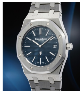
122 Audemars Piguet 愛彼，罕有精美，精鋼鏈帶腕錶... 估價 40,000 — 80,000 CHF