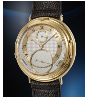
27 George Daniels George Daniels, 獨一無二、極... 估價 1,000,000 — 0 CHF