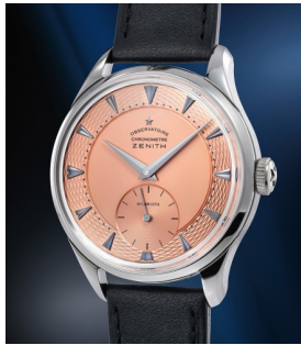
21 Zenith X Voutilainen ... 真力時 X Voutilainen X 百達翡麗... 估價 100,000 — 200,000 CHF

Geneva Auction / 5 November 2022 / 2pm CET