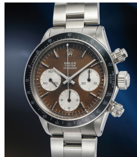
167 Rolex 勞力士，早期及十分精美，精鋼... 估價 80,000 — 160,000 CHF