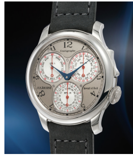
133 F.P. Journe F.P. Journe , 精美, 計時腕錶, ... 估價 80,000 — 160,000 CHF