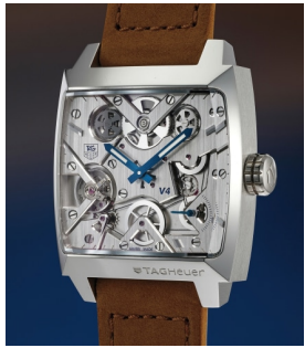
221 TAG Heuer 豪雅，非常精細，鉑金腕錶，備... 估價 20,000 — 40,000 CHF

Geneva Auction / 5 November 2022 / 2pm CET