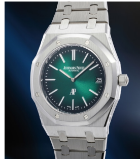
222 Audemars Piguet 愛彼，精美全新，鉑金鏈帶腕錶... 估價 100,000 — 200,000 CHF