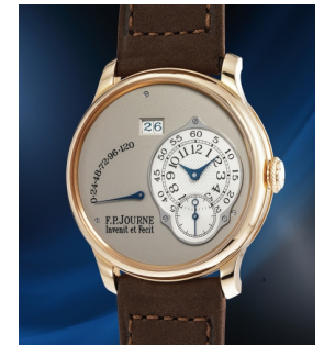
230 F.P. Journe F.P. Journe，罕有、早期、精美... 估價 70,000 — 140,000 CHF