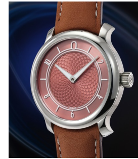
134 Ming Ming , 非常精美, 精鋼腕錶, 備... 估價 2,000 — 4,000 CHF