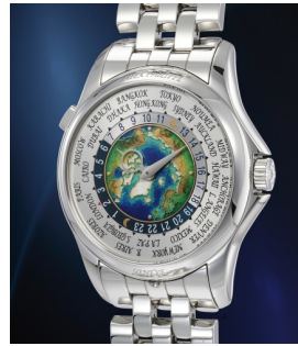
43 Patek Philippe 百達翡麗，極度精細，鉑金世界... 估價 80,000 — 160,000 CHF