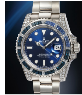
44 Rolex 勞力士，十分罕有精美，白金鑲... 估價 100,000 — 200,000 CHF