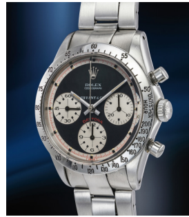
42 Rolex 勞力士，極度罕有精美，精鋼計... 估價 300,000 — 600,000 CHF