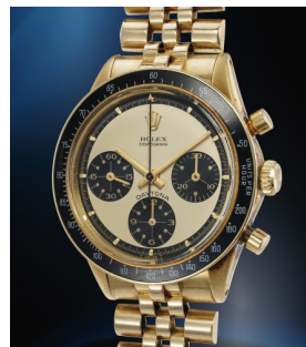
102 Rolex 勞力士，十分精美罕有，黃金計... 估價 400,000 — 800,000 CHF