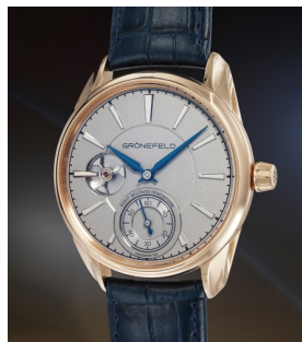
51 Grönefeld Grönefeld, 極度精美, 玫瑰金原... 估價 35,000 — 70,000 CHF

Geneva Auction / 5 November 2022 / 2pm CET