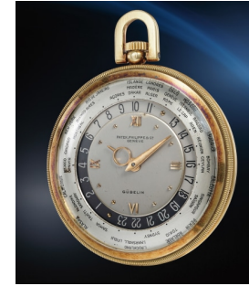
64 Patek Philippe 百達翡麗，罕有精美，黃金世界... 估價 40,000 — 80,000 CHF