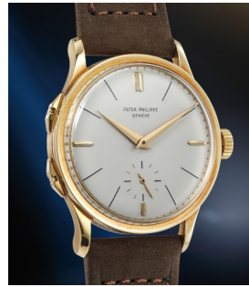
213 Patek Philippe 百達翡麗，非常優雅，黃金腕錶... 估價 40,000 — 80,000 CHF