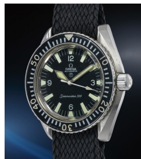
127 Omega 歐米茄，罕有精美，精鋼潛水腕... 估價 30,000 — 50,000 CHF