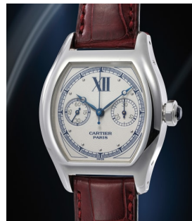
218 Cartier 卡地亞，十分罕有精美，白金單... 估價 20,000 — 40,000 CHF