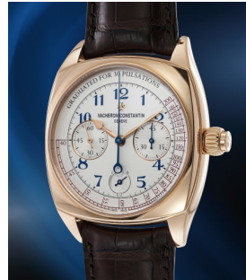
67 Vacheron Constantin 江詩丹頓，精美，玫瑰金單鈕計... 估價 30,000 — 60,000 CHF