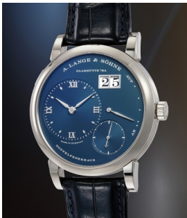
6 A. Lange & Söhne 朗格，精細，白金腕錶，備藍色... 估價 20,000 — 40,000 CHF