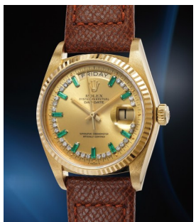
60 Rolex 勞力士, 非常精美, 黃金鑲鑽及... 估價 15,000 — 30,000 CHF