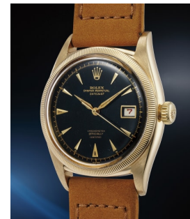
159 Rolex 勞力士，極度罕有、精美，黃金... 估價 20,000 — 40,000 CHF