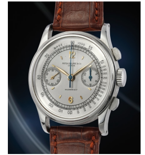
215 Patek Philippe 百達翡麗，極度罕有重要，大型... 估價 500,000 — 1,000,000 CHF