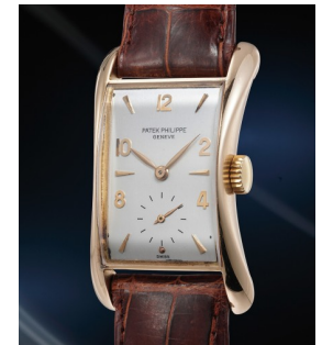
150 Patek Philippe 百達翡麗, 十分罕有, 玫瑰金萬... 估價 20,000 — 40,000 CHF