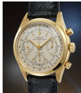
157 Rolex 勞力士，極度精美，黃金計時腕... 估價 60,000 — 120,000 CHF