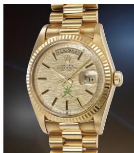
108 Rolex 勞力士，罕有精美，黃金年曆鐘... 估價 25,000 — 50,000 CHF