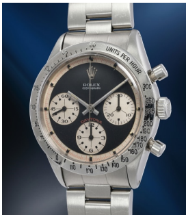
196 Rolex 勞力士，早期及精美，精鋼計時... 估價 100,000 — 200,000 CHF