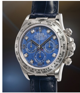
32 此拍品已不再提供買賣。 Rolex 勞力士，十分罕有精美，白金計... 估價 20,000 — 40,000 CHF