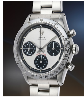
82 Rolex 勞力士，十分罕有，精鋼計時錶... 估價 120,000 — 240,000 CHF