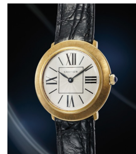
59 Cartier 卡地亞, 極度精美, 黃金腕錶。 估價 8,000 — 16,000 CHF