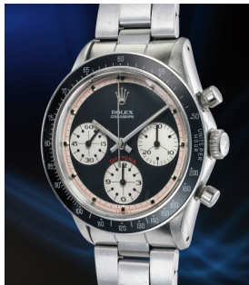
176 Rolex 勞力士，罕有精美，精鋼計時鏈... 估價 150,000 — 300,000 CHF