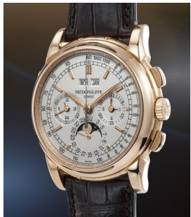
16 Patek Philippe 百達翡麗，罕有精美，玫瑰金萬... 估價 100,000 — 200,000 CHF