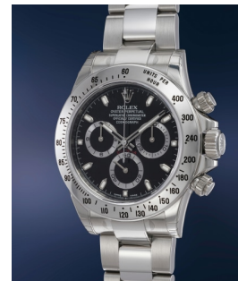
119 Rolex 勞力士，「全新舊款」，精鋼計... 估價 15,000 — 25,000 CHF