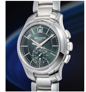
5 Patek Philippe 百達翡麗，罕有精美，精鋼年曆... 估價 40,000 — 80,000 CHF