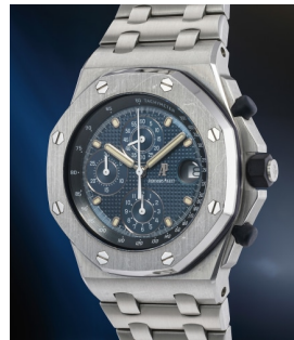
178 Audemars Piguet 愛彼，非常早期、罕有精美，精... 估價 50,000 — 100,000 CHF