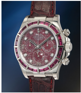
11 Rolex 勞力士，極度精美罕有，白金鑲... 估價 100,000 — 200,000 CHF

Geneva Auction / 5 November 2022 / 2pm CET