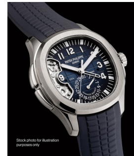
149 Patek Philippe 百達翡麗, 十分罕有, 兩地時區... 估價 300,000 — 600,000 CHF