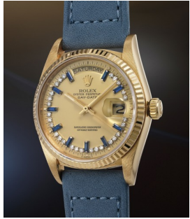
61 Rolex 勞力士，罕有精美，黃金鑲鑽及... 估價 15,000 — 30,000 CHF

Geneva Auction / 5 November 2022 / 2pm CET