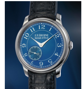
90 F.P. Journe F.P. Journe，非常優雅，鈦金屬... 估價 30,000 — 60,000 CHF