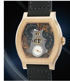
24 F.P. Journe F.P. Journe, 非常精美, 玫瑰金... 估價 120,000 — 240,000 CHF