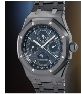
224 Audemars Piguet 愛彼，精美、極度罕有，黑色陶... 估價 180,000 — 360,000 CHF