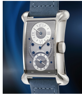
23 Voutilainen Voutilainen, 極度罕有、重要, ... 估價 50,000 — 100,000 CHF