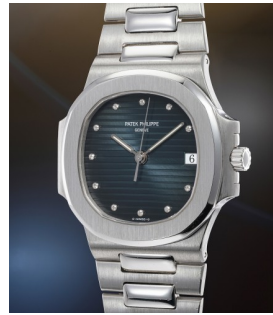
223 Patek Philippe 百達翡麗，十分罕有，鉑金鏈帶... 估價 70,000 — 140,000 CHF