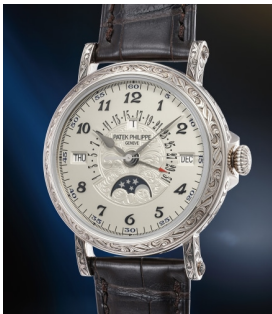
86 Patek Philippe 百達翡麗，非常精細，白金萬年... 估價 70,000 — 140,000 CHF