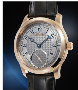
48 J.N. Shapiro J.N. Shapiro，非常精美，玫瑰金... 估價 15,000 — 30,000 CHF