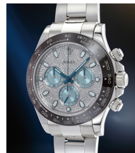
129 Rolex 勞力士，精細，鉑金鑲鑽計時鏈... 估價 120,000 — 200,000 CHF