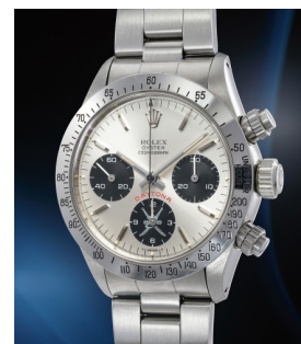
109 Rolex 勞力士，罕有，精鋼計時鐘帶腕... 估價 150,000 — 300,000 CHF