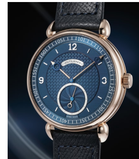
29 Voutilainen Voutilainen, 獨一無二、十分精... 估價 70,000 — 140,000 CHF