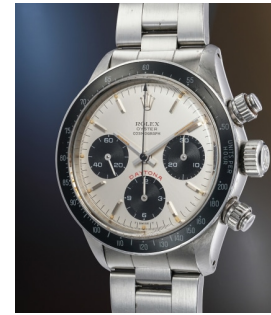
84 Rolex 勞力士，十分罕有精美，精鋼計... 估價 50,000 — 100,000 CHF