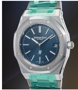
83 Audemars Piguet 愛彼，全新，精鋼鏈帶腕錶，備... 估價 40,000 — 80,000 CHF