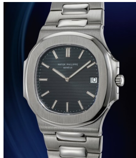
148 Patek Philippe 百達翡麗, 罕有精美, 精鋼鏈帶... 估價 70,000 — 140,000 CHF