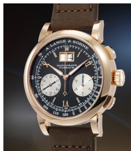
208 A. Lange & Söhne 朗格，罕有優雅，玫瑰金飛返計... 估價 30,000 — 60,000 CHF