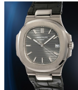
169 Patek Philippe 百達翡麗，精細罕有，白金腕錶... 估價 35,000 — 70,000 CHF