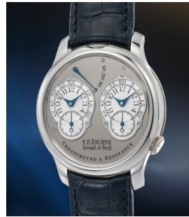
22 F.P. Journe F.P. Journe, 十分罕有, 鉑金兩... 估價 140,000 — 280,000 CHF