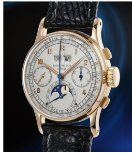
153 Patek Philippe 百達翡麗，非常罕有、極度精細... 估價 800,000 — 1,600,000 CHF