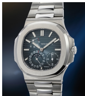
56 Patek Philippe 百達翡麗, 極度罕有, 精鋼鏈帶... 估價 80,000 — 160,000 CHF