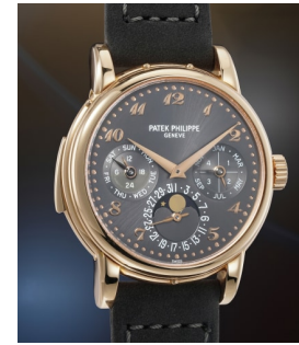
214 Patek Philippe 百達翡麗，可能獨一無二、早期... 估價 300,000 — 600,000 CHF