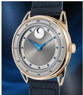
136 De Bethune De Bethune , 獨一無二, 玫瑰金... 估價 40,000 — 80,000 CHF