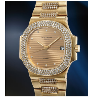
175 Patek Philippe 百達翡麗，罕有精美，黃金鑲鑽... 估價 80,000 — 160,000 CHF