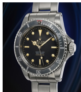
107 Rolex 勞力士，極度罕有、十分重要、... 估價 100,000 — 200,000 CHF