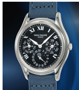
52 Patek Philippe 百達翡麗, 罕有精美, 鉑金萬年... 估價 30,000 — 60,000 CHF