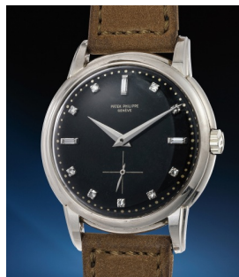
203 Patek Philippe 百達翡麗，可能獨一無二、十分... 估價 150,000 — 300,000 CHF