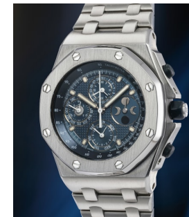
219 Audemars Piguet 愛彼，十分精細，大型精鋼萬年... 估價 50,000 — 100,000 CHF