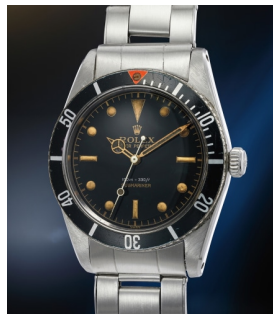
158 Rolex 勞力士，極度精美，精鋼鏈帶腕... 估價 50,000 — 100,000 CHF