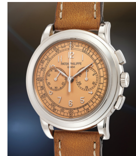
19 Patek Philippe 百達翡麗，重要、精美、罕有，... 估價 200,000 — 400,000 CHF