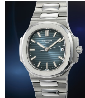
179 Patek Philippe 百達翡麗，罕有精美，精鋼鏈帶... 估價 70,000 — 140,000 CHF