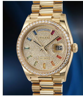
173 Rolex 勞力士，罕有精美，黃金鑲鑽及... 估價 30,000 — 50,000 CHF