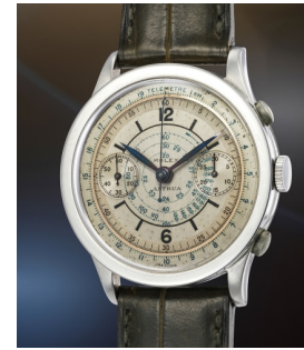
164 Rolex 勞力士，極度罕有，精鋼計時腕... 估價 70,000 — 140,000 CHF