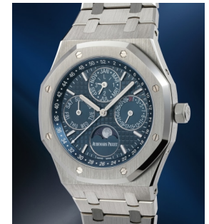
180 Audemars Piguet 愛彼，非常精美罕有，精鋼萬年... 估價 80,000 — 160,000 CHF