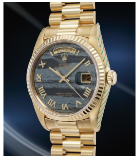
186 Rolex 勞力士，罕有精美，黃金年曆腕... 估價 15,000 — 30,000 CHF