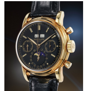
20 Patek Philippe 百達翡麗，十分精細、極度罕有... 估價 400,000 — 800,000 CHF