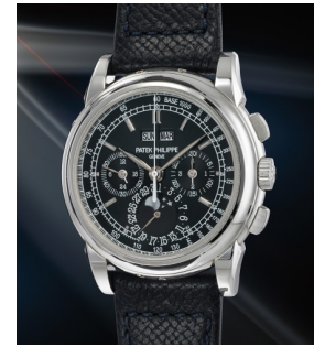
15 Patek Philippe 百達翡麗，十分罕有精美，鉑金... 估價 120,000 — 200,000 CHF