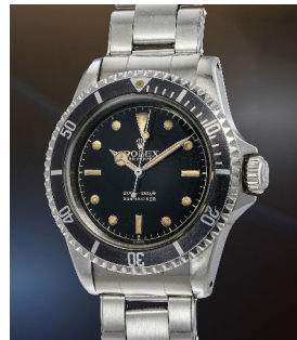
37 Rolex 勞力士，精美，精鋼鏈帶腕錶，... 估價 40,000 — 80,000 CHF