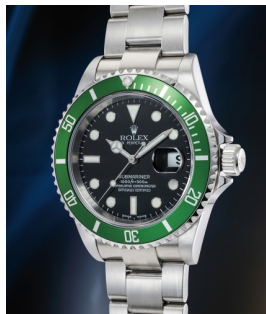
118 Rolex 勞力士，十分罕有精美，精鋼腕... 估價 15,000 — 30,000 CHF