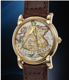
66 Vacheron Constantin 江詩丹頓，精美，黃金腕錶，備... 估價 25,000 — 50,000 CHF