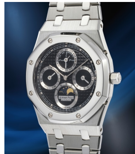
147 Audemars Piguet 愛彼, 極度精美, 精鋼及鉑金萬... 估價 80,000 — 160,000 CHF