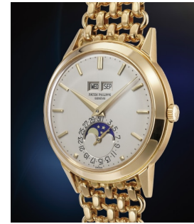
154 Patek Philippe 百達翡麗，罕有、可能獨一無二... 估價 100,000 — 200,000 CHF