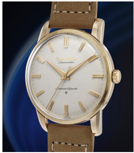
31 Grand Seiko 精工，早期、精細，鍍金腕錶，... 估價 5,000 — 10,000 CHF

Geneva Auction / 5 November 2022 / 2pm CET