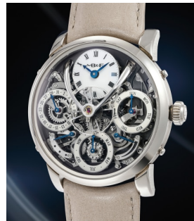
227 MB&F MB&F，精細，白金鏤空萬年曆... 估價 60,000 — 120,000 CHF