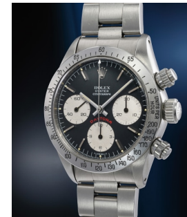
39 Rolex 勞力士，罕有精美，精鋼計時腕... 估價 60,000 — 100,000 CHF