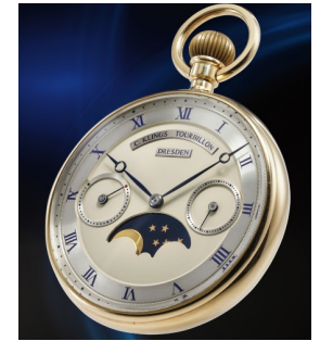
25 Christian Klings Christian Klings, 獨一無二, 自... 估價 60,000 — 120,000 CHF