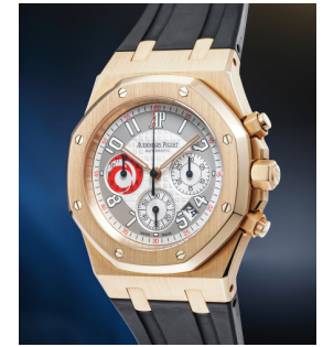
145 Audemars Piguet 愛彼, 精細, 玫瑰金計時腕錶, ... 估價 30,000 — 60,000 CHF