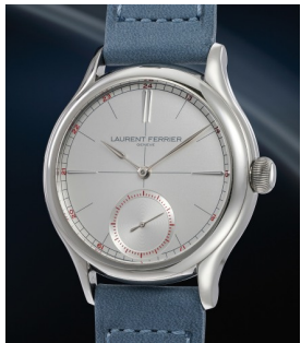
226 Laurent Ferrier Laurent Ferrier，罕有精細，鈦... 估價 25,000 — 50,000 CHF