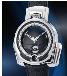
137 De Bethune De Bethune , 獨一無二, 鉑金原... 估價 80,000 — 160,000 CHF