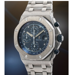
10 Audemars Piguet 愛彼，罕有精細，白金鑲鑽計時... 估價 50,000 — 100,000 CHF