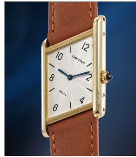
183 Cartier 卡地亞，十分罕有精美，限量版... 估價 30,000 — 60,000 CHF