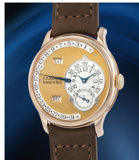
47 F.P. Journe F.P. Journe，非常罕有、早期，... 估價 80,000 — 160,000 CHF