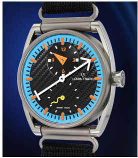
131 Louis Erard X Alain Si... Louis Erard X Alain Silberstein , ... 估價 2,000 — 4,000 CHF

Geneva Auction / 5 November 2022 / 2pm CET