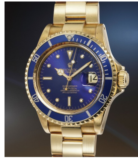
192 Rolex 勞力士，十分罕有精美，黃金鏈... 估價 30,000 — 60,000 CHF