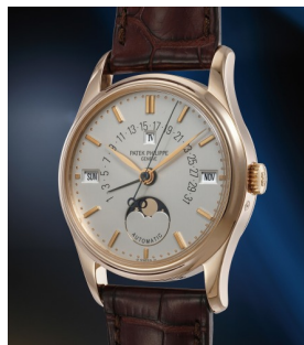
121 Patek Philippe 百達翡麗，優雅、罕有、精美，... 估價 35,000 — 70,000 CHF

Geneva Auction / 5 November 2022 / 2pm CET