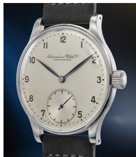
201 IWC 萬國，精細罕有，超大精鋼腕錶... 估價 15,000 — 30,000 CHF

Geneva Auction / 5 November 2022 / 2pm CET