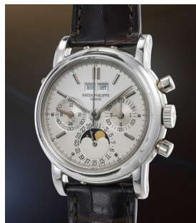
53 Patek Philippe 百達翡麗, 十分罕有, 鉑金萬年... 估價 80,000 — 160,000 CHF