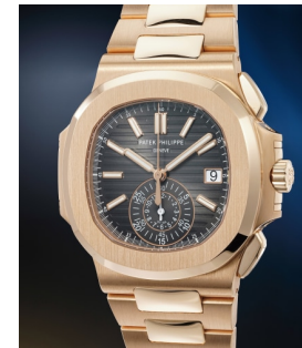
189 Patek Philippe 百達翡麗，極度罕有，玫瑰金計... 估價 150,000 — 300,000 CHF