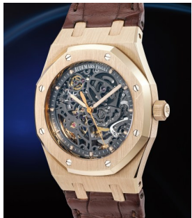
146 Audemars Piguet 愛彼, 極度精美, 玫瑰金腕錶, ... 估價 70,000 — 140,000 CHF