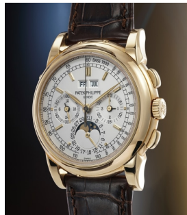
18 Patek Philippe 百達翡麗，罕有精美，黃金萬年... 估價 80,000 — 160,000 CHF