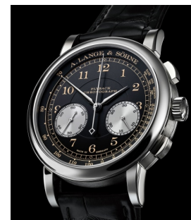
209 A. Lange & Söhne 朗格，獨一無二，白金飛返計時... 估價 100,000 — 200,000 CHF