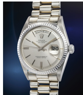
217 Rolex 勞力士，罕有精美，白金自動上... 估價 15,000 — 30,000 CHF