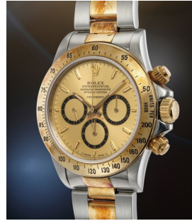
63 Rolex 勞力士，十分罕有精美，精鋼及... 估價 25,000 — 50,000 CHF