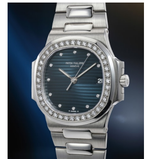
170 Patek Philippe 百達翡麗，十分罕有精美，鉑金... 估價 80,000 — 160,000 CHF