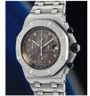
35 Audemars Piguet 愛彼，罕有精美，精鋼計時鏈帶... 估價 25,000 — 50,000 CHF