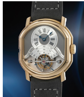
28 Daniel Roth Daniel Roth, 罕有, 玫瑰金雙面... 估價 30,000 — 60,000 CHF