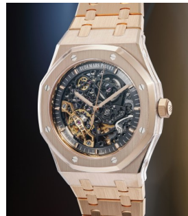
87 Audemars Piguet 愛彼，精美，玫瑰金鏈帶腕錶，... 估價 90,000 — 180,000 CHF