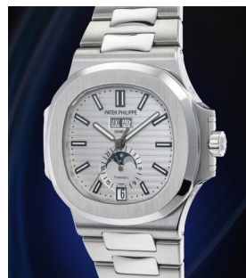
57 Patek Philippe 百達翡麗, 十分罕有, 精鋼年曆... 估價 70,000 — 140,000 CHF