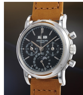
54 Patek Philippe 百達翡麗, 非常精美罕有, 鉑金... 估價 100,000 — 150,000 CHF