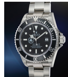
130 Rolex 勞力士，「全新舊款」，精鋼潛... 估價 150,000 — 300,000 CHF