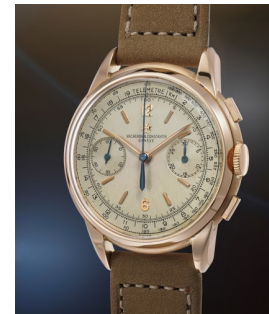
199 Vacheron Constantin 江詩丹頓，極度罕有，玫瑰金計... 估價 30,000 — 60,000 CHF