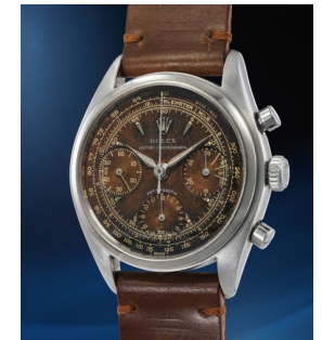
40 Rolex 勞力士，十分精美，精鋼計時腕... 估價 120,000 — 240,000 CHF