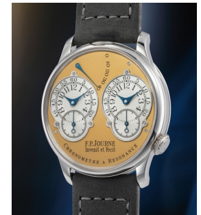
140 F.P. Journe F.P. Journe , 罕有精美, 鉑金天... 估價 180,000 — 360,000 CHF