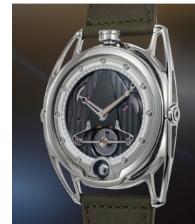
49 De Bethune De Bethune，精美，鈦金屬腕錶... 估價 50,000 — 100,000 CHF