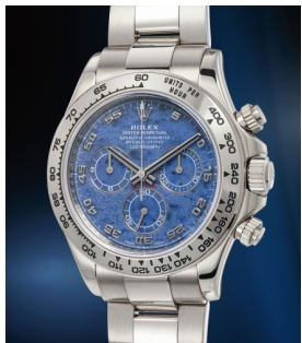
156 Rolex 勞力士，精美優雅，白金計時鐘... 估價 40,000 — 80,000 CHF