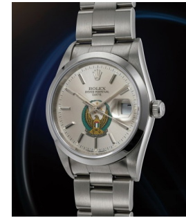
194 Rolex 勞力士，極度罕有，「全新舊款... 估價 2,000 — 4,000 CHF