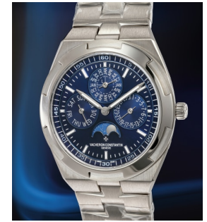
85 Vacheron Constantin 江詩丹頓，極度精美，超薄白金... 估價 70,000 — 140,000 CHF