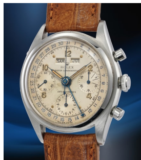
103 Rolex 勞力士，極度罕有、十分精細，... 估價 150,000 — 300,000 CHF