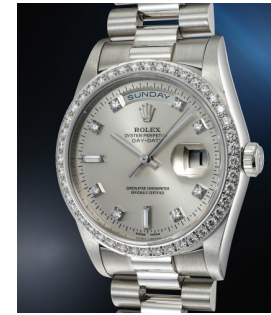
34 Rolex 勞力士，十分罕有精美，鉑金年... 估價 25,000 — 50,000 CHF