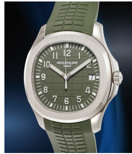
3 Patek Philippe 百達翡麗，優雅，白金腕錶。附... 估價 60,000 — 120,000 CHF