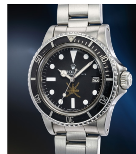
110 Rolex 勞力士，非常罕有、極度重要，... 估價 250,000 — 500,000 CHF