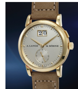
210 A. Lange & Söhne 朗格，早期、罕有、精美，黃金... 估價 10,000 — 20,000 CHF