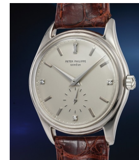
205 Patek Philippe 百達翡麗，非常重要，白金自動... 估價 100,000 — 200,000 CHF