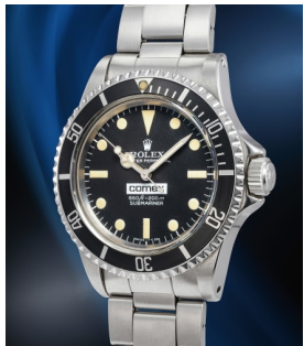
36 Rolex 勞力士，十分罕有，精鋼軍用腕... 估價 60,000 — 120,000 CHF