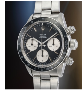
195 Rolex 勞力士，十分精美，精鋼計時鏈... 估價 50,000 — 100,000 CHF