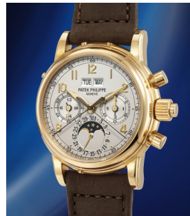
187 Patek Philippe 百達翡麗，罕有，黃金萬年曆追... 估價 120,000 — 240,000 CHF