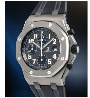
165 Audemars Piguet 愛彼，十分罕有精美，鈦金計時... 估價 12,000 — 18,000 CHF