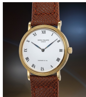
58 Patek Philippe 百達翡麗, 優雅, 黃金腕錶, 備... 估價 10,000 — 15,000 CHF