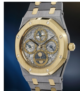
124 Audemars Piguet 愛彼，極度罕有，鈦金屬及黃金... 估價 100,000 — 200,000 CHF