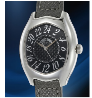
225 Cédric Johner Cédric Johner，罕有，精鋼腕錶... 估價 2,000 — 4,000 CHF