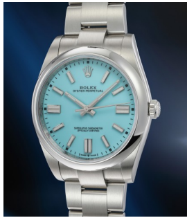
1 Rolex 勞力士，精細，精鋼腕錶，備中... 估價 5,000 — 10,000 CHF