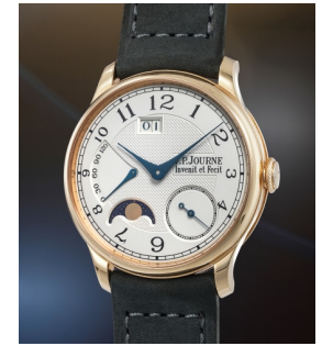
135 F.P. Journe F.P. Journe , 精美, 玫瑰金自動... 估價 40,000 — 80,000 CHF