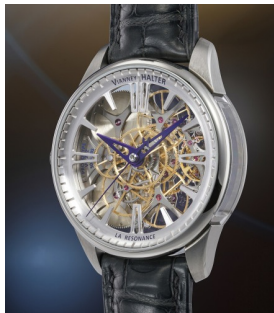
26 Vianney Halter Vianney Halter, 獨一無二, 鈦... 估價 100,000 — 200,000 CHF