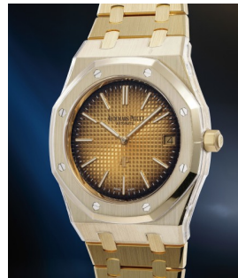
8 Audemars Piguet 愛彼，黃金鏈帶腕錶，備日期顯... 估價 50,000 — 100,000 CHF