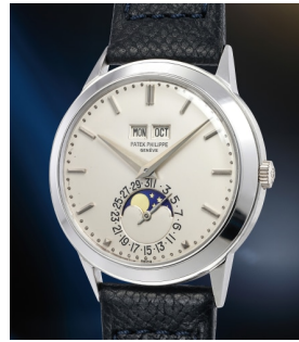
152 Patek Philippe 百達翡麗，非常罕有精細，白金... 估價 400,000 — 800,000 CHF