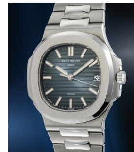
55 Patek Philippe 百達翡麗, 精細罕有, 精鋼自動... 估價 80,000 — 160,000 CHF