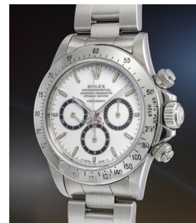
104 Rolex 勞力士，十分罕有精美，精鋼計... 估價 60,000 — 120,000 CHF