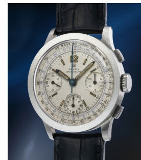
105 Rolex 勞力士，極度罕有，大型精鋼防... 估價 150,000 — 300,000 CHF