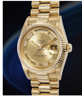
193 Rolex 勞力士，罕有精美，黃金年曆鏈... 估價 12,000 — 14,000 CHF