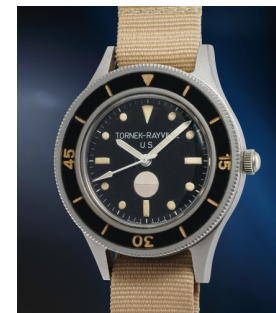
125 Tornek-Rayville Tornek-Rayville，極度罕有重要... 估價 60,000 — 120,000 CHF