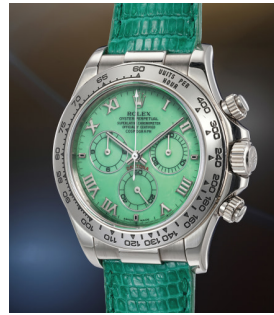
172 Rolex 勞力士，罕有精美，白金計時腕... 估價 20,000 — 40,000 CHF