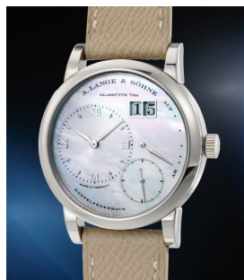
206 A. Lange & Söhne 朗格，非常優雅，白金腕錶，備... 估價 15,000 — 30,000 CHF