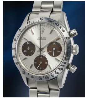
163 Rolex 勞力士，精美，精鋼計時鏈帶腕... 估價 50,000 — 100,000 CHF