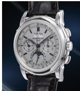
17 Patek Philippe 百達翡麗，優雅精細，白金萬年... 估價 100,000 — 200,000 CHF