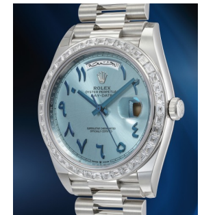
220 Rolex 勞力士，非常罕有、十分精美，... 估價 100,000 — 200,000 CHF