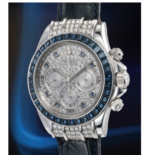
160 Rolex 勞力士，極度精美，白金鑲鑽及... 估價 100,000 — 200,000 CHF