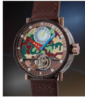
132 Alain Silberstein Alain Silberstein , 非常罕有精美... 估價 20,000 — 40,000 CHF