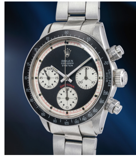
162 Rolex 勞力士，十分罕有精美，精鋼計... 估價 400,000 — 800,000 CHF