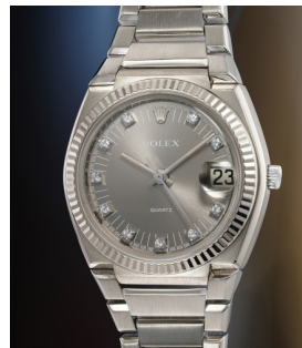
168 Rolex 勞力士，可能獨一無二，白金電... 估價 35,000 — 70,000 CHF