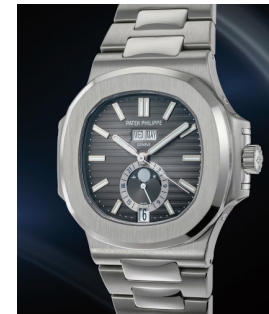
9 Patek Philippe 百達翡麗，罕有精美，精鋼年曆... 估價 35,000 — 70,000 CHF