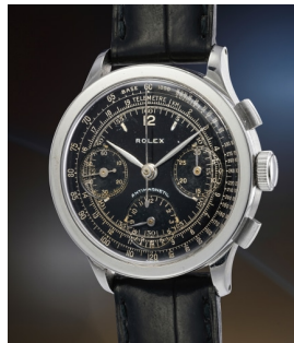
198 Rolex 勞力士，非常罕有精美，大型精... 估價 150,000 — 300,000 CHF