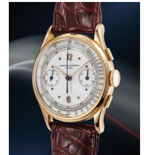
200 Vacheron Constantin 江詩丹頓，優雅，玫瑰金腕錶，... 估價 15,000 — 25,000 CHF