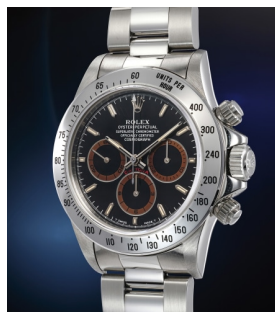
128 Rolex 勞力士，極度精美，精鋼計時鏈... 估價 35,000 — 70,000 CHF