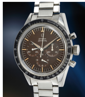
202 Omega 歐米茄，極度精美、早期、非常... 估價 30,000 — 60,000 CHF