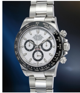
2 Rolex 勞力士，精美，精鋼計時鏈帶腕... 估價 15,000 — 25,000 CHF