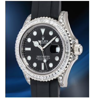
45 Rolex 勞力士，十分罕有精美，白金鑲... 估價 70,000 — 140,000 CHF