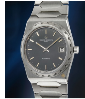
14 Vacheron Constantin 江詩丹頓，罕有精美，精鋼鏈帶... 估價 30,000 — 60,000 CHF