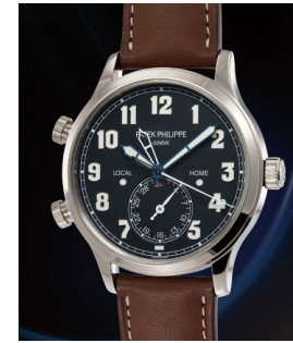
4 Patek Philippe 百達翡麗，精美，白金兩地時區... 估價 20,000 — 40,000 CHF