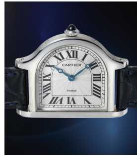
182 Cartier 卡地亞，獨一無二，訂製鐘形鉑... 估價 30,000 — 60,000 CHF