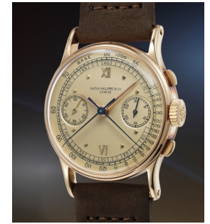
155 Patek Philippe 百達翡麗，可能獨一無二、十分... 估價 200,000 — 400,000 CHF