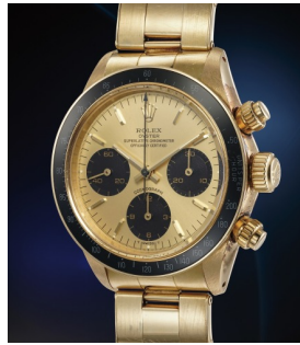
12 Rolex 勞力士，極度精美，黃金計時鏈... 估價 100,000 — 200,000 CHF