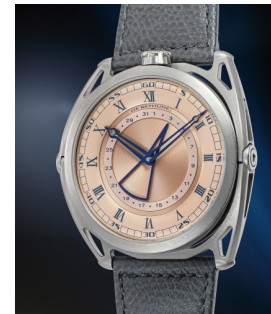
89 De Bethune De Bethune，精美罕有，噴砂鈦... 估價 30,000 — 50,000 CHF