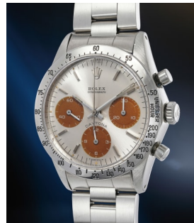
197 Rolex 勞力士，十分精美，精鋼計時鏈... 估價 80,000 — 160,000 CHF