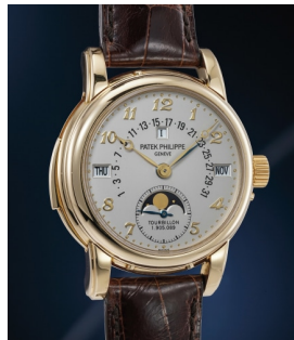
88 Patek Philippe 百達翡麗，極度罕有重要，黃金... 估價 250,000 — 500,000 CHF