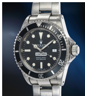
126 Rolex 勞力士，精細、非常罕有，精鋼... 估價 40,000 — 80,000 CHF