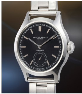
151 Patek Philippe 百達翡麗，極度罕有，精鋼腕錶... 估價 100,000 — 200,000 CHF

Geneva Auction / 5 November 2022 / 2pm CET