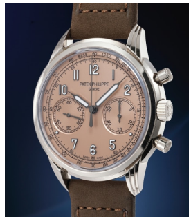
116 Patek Philippe 百達翡麗，罕有精美，白金計時... 估價 40,000 — 60,000 CHF