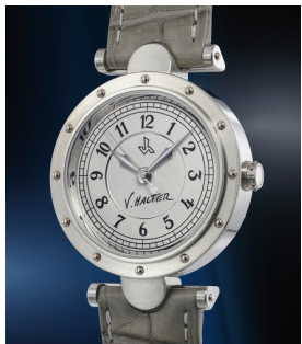
46 Vianney Halter Vianney Halter，非常精美，限... 估價 30,000 — 60,000 CHF