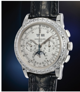
171 Patek Philippe 百達翡麗，罕有、可能獨一無二... 估價 180,000 — 360,000 CHF

Geneva Auction / 5 November 2022 / 2pm CET