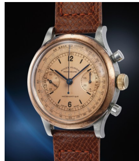
38 Rolex 勞力士，精美，玫瑰金及精鋼計... 估價 30,000 — 60,000 CHF