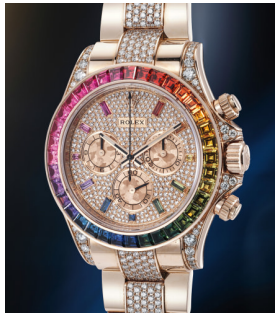
41 Rolex 勞力士，極度罕有、十分精美，... 估價 250,000 — 500,000 CHF

Geneva Auction / 5 November 2022 / 2pm CET