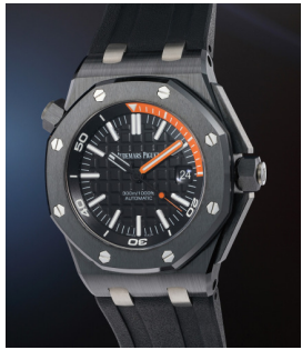
81 Audemars Piguet 愛彼，精細，陶瓷腕錶，備15分... 估價 15,000 — 30,000 CHF

Geneva Auction / 5 November 2022 / 2pm CET