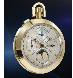
65 Audemars Piguet 愛彼，非常罕有精美，黃金三問... 估價 40,000 — 80,000 CHF