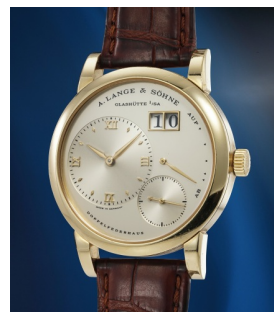
207 A. Lange & Söhne 朗格，十分罕有、早期、精美，... 估價 10,000 — 20,000 CHF