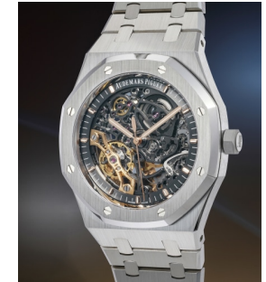
70 Audemars Piguet 愛彼，非常精美，精鋼鏤空鏈帶... 估價 80,000 — 160,000 CHF