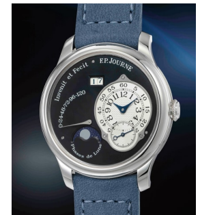
50 F.P. Journe F.P. Journe，極度罕有，鉑金腕... 估價 80,000 — 160,000 CHF