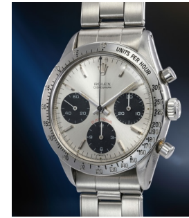
174 Rolex 勞力士，罕有精美，精鋼計時鏈... 估價 60,000 — 120,000 CHF