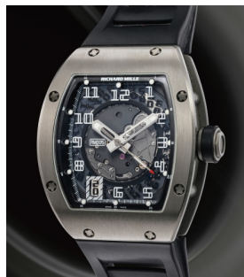
123 Richard Mille Richard Mille，非常罕有精美，... 估價 30,000 — 60,000 CHF