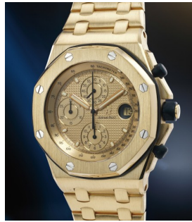
13 Audemars Piguet 愛彼，重要罕有，黃金大型計時... 估價 50,000 — 100,000 CHF