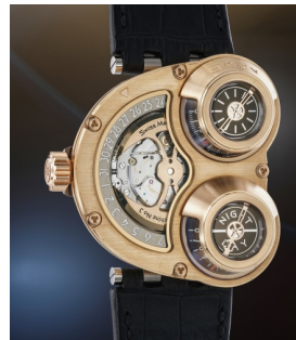
228 MB&F MB&F，精細，玫瑰金立體腕錶... 估價 30,000 — 60,000 CHF