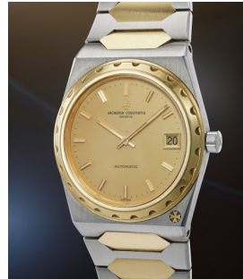
68 Vacheron Constantin 江詩丹頓，非常罕有精美，黃金... 估價 25,000 — 50,000 CHF