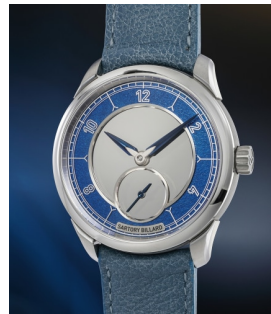
138 Sartory Billard Sartory Billard , 非常優雅, 訂... 估價 3,000 — 6,000 CHF