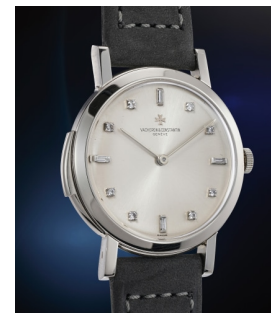
204 Vacheron Constantin 江詩丹頓，極度優雅、罕有，白... 估價 100,000 — 200,000 CHF