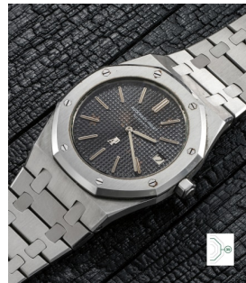
8 Audemars Piguet 愛彼，十分重要及極為精細，精... 估價 200,000 — 400,000 CHF