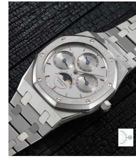
4 Audemars Piguet 愛彼，精細罕有，精鋼萬年曆鏈... 估價 70,000 — 140,000 CHF