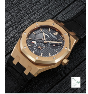
45 Audemars Piguet 愛彼，罕有，玫瑰金兩地時區鏈... 估價 15,000 — 30,000 CHF