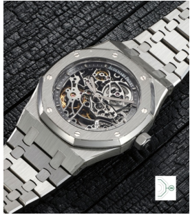
41 Audemars Piguet 愛彼，極為精美，精鋼腕錶，備... 估價 40,000 — 80,000 CHF