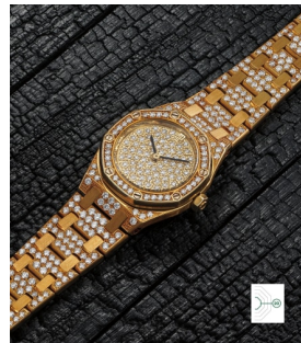
48 Audemars Piguet 愛彼，非常精美，黃金鑲鑽腕錶... 估價 12,000 — 24,000 CHF