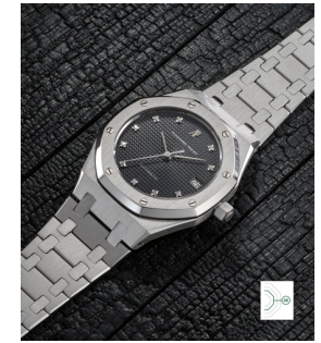
5 Audemars Piguet 愛彼，優雅罕有，白金鏈帶腕錶... 估價 25,000 — 45,000 CHF