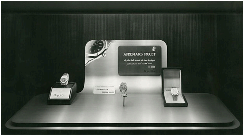
The Royal Oak Ref. 5402 at the Audemars Piguet booth at Baselworld in 1972.

Considering the skepticism the Royal Oak was met with 50 years ago due to its avant-garde, novel design and philosophy, one can only assume that the buyer was himself a forward thinking, risk taking individual.