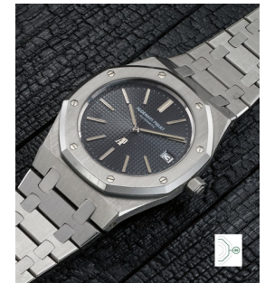
50 Audemars Piguet 愛彼，罕有精細，精鋼鏈帶腕錶... 估價 80,000 — 160,000 CHF