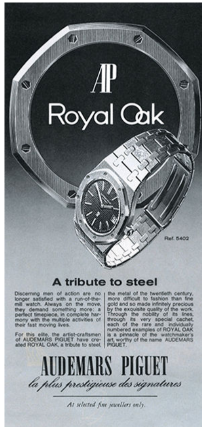
Advertisement of the Royal Oak Ref. 5402 from 1972.

Launched in 1972, the Audemars Piguet Royal Oak was the world's first stainless steel luxury sports watch with a fully integrated bracelet. Designed overnight in response to an urgent request for an 'unprecedented steel watch', it was at the same time the most expensive stainless steel watch ever made.