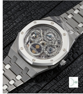
42 Audemars Piguet 愛彼，非常罕有，限量版精鋼及... 估價 150,000 — 300,000 CHF