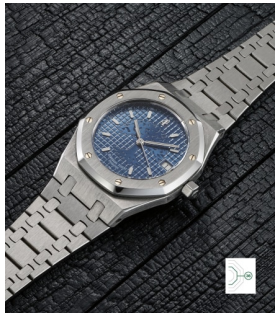
1 Audemars Piguet 愛彼，非常罕有，限量版精鋼腕... 估價 15,000 — 25,000 CHF