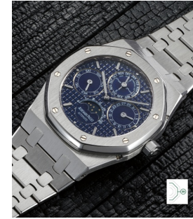
44 Audemars Piguet 愛彼，罕有，精鋼萬年曆腕錶，... 估價 100,000 — 200,000 CHF