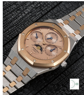
47 Audemars Piguet 愛彼，極為罕有精美，鉑金及玫... 估價 100,000 — 200,000 CHF