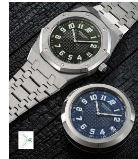
9 Audemars Piguet 愛彼，非常精美罕有，限量版精... 估價 100,000 — 200,000 CHF