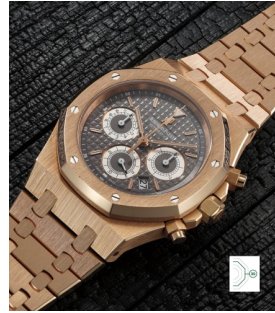
43 Audemars Piguet 愛彼，非常精美，玫瑰金計時鏈... 估價 30,000 — 60,000 CHF