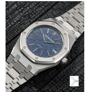
10 Audemars Piguet 愛彼，極為精美，限量版鉑金鏈... 估價 250,000 — 500,000 CHF