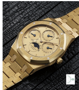
7 Audemars Piguet 愛彼，非常罕有，黃金萬年曆鏈... 估價 70,000 — 140,000 CHF