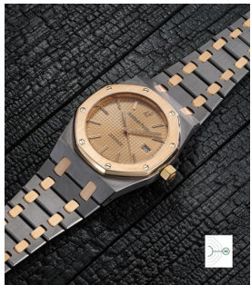
6 Audemars Piguet 愛彼，罕有精美，鈦金屬及玫瑰... 估價 10,000 — 20,000 CHF