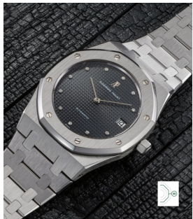
46 Audemars Piguet 愛彼，極為罕有精細，白金腕錶... 估價 80,000 — 160,000 CHF