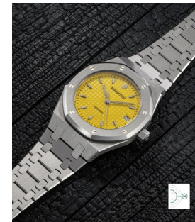
49 Audemars Piguet 愛彼，非常精美，精鋼鏈帶腕錶... 估價 30,000 — 60,000 CHF