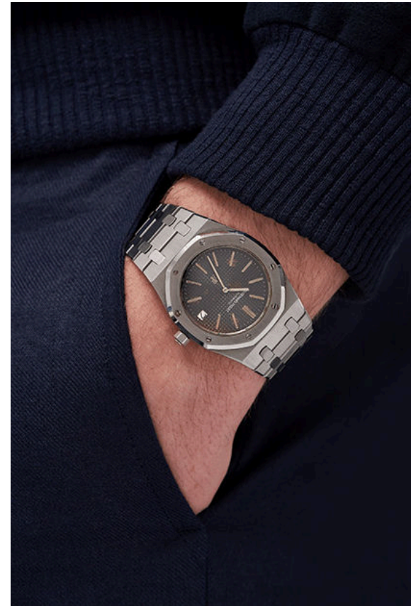
Audemars Piguet, Royal Oak A series "The A2" Ref. 5402ST

The lowest numbered reference 5402 A series to ever come to the market, the present watch is unpolished. The dial has started to develop a very pleasant gold copper tone on certain areas giving it even greater panache.