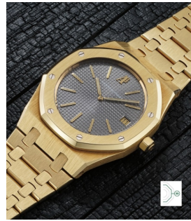
3 Audemars Piguet 愛彼，精美罕有，限量版黃金腕... 估價 60,000 — 120,000 CHF