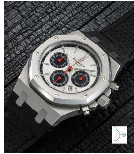
2 Audemars Piguet 愛彼，限量版精鋼計時腕錶，限... 估價 20,000 — 40,000 CHF